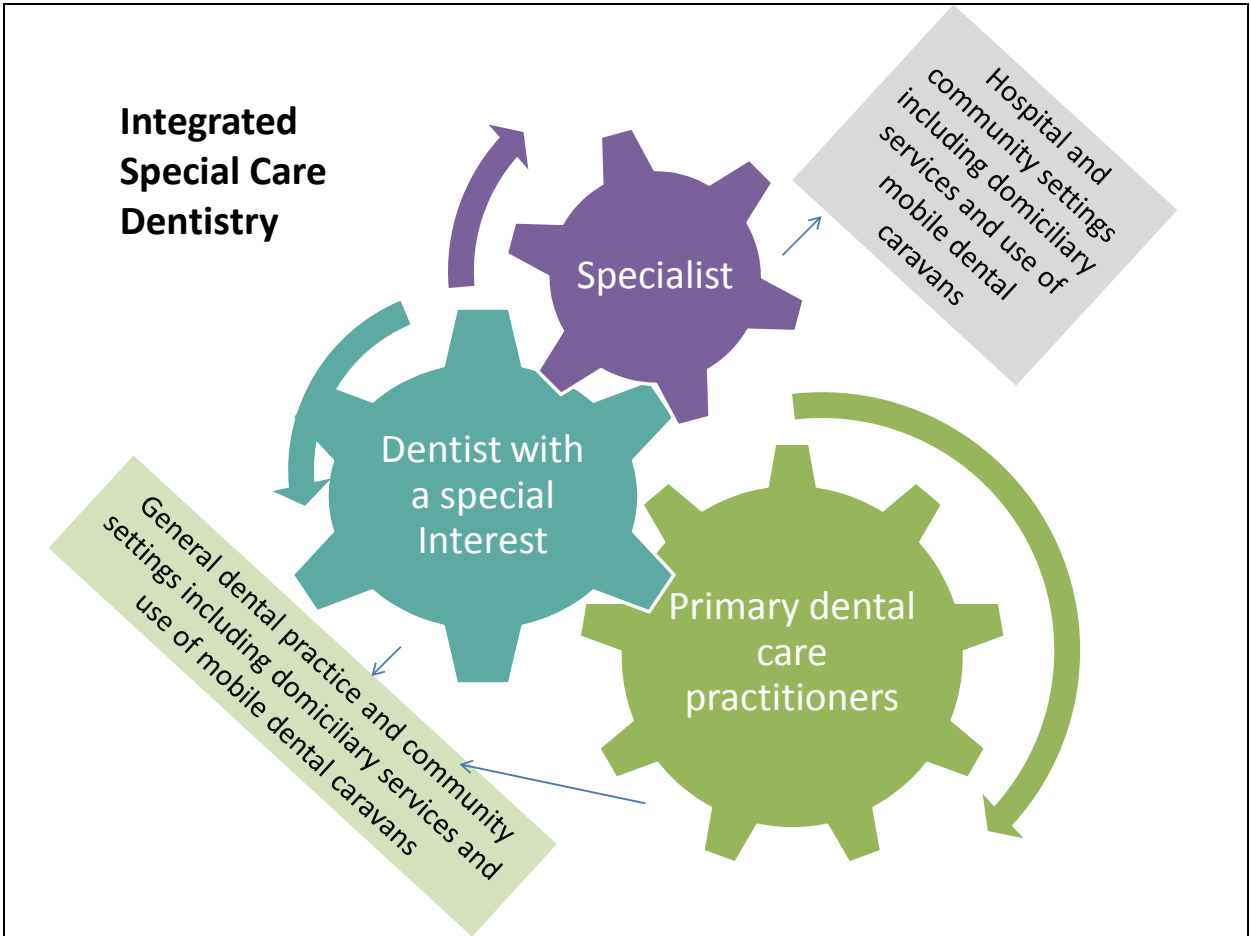
Fig. 1. Integrated network of care