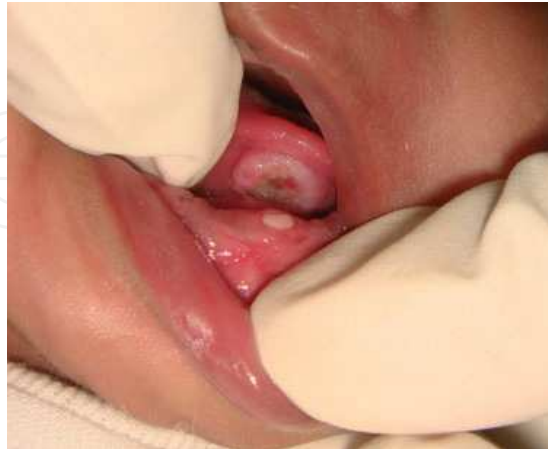
Fig. 1. Intraoral view showing a natal teeth and Riga-Fede disease (quoted from Padmanabhan et al. (2010) Neonatal sublingual traumatic ulceration - case report & review of the literature. Dent Traumatol 26, 6, Dec, 490-5.)

interfere with breastfeeding or not hypermobile, no intervention is necessary. Consultation with a pediatric dentist is strongly recommended in order to evaluate the preferred treatment and for differential diagnosis. Eruption of teeth during the neonatal period causes fewer problems. These teeth can usually be maintained even though root development is limited (Figure 1).