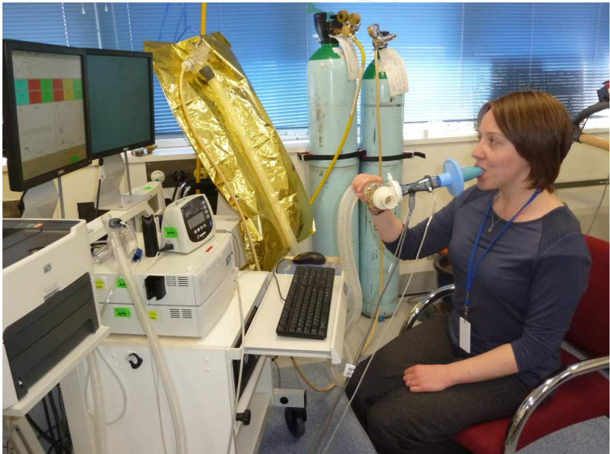
Picture 1. Eucapnic Voluntary Hyperventilation testing

monitoring a physiological response, it can be negative in patients with well-controlled asthma. This feature can be used clinically, as a mannitol challenge test, similar to an exercise, and hypertonic saline challenge test can be negative in patients whose asthma is very well controlled. If a clinical suspicion of exercise induced asthma persists then performance of the Eucapnic Hyperventilation Test should be considered.