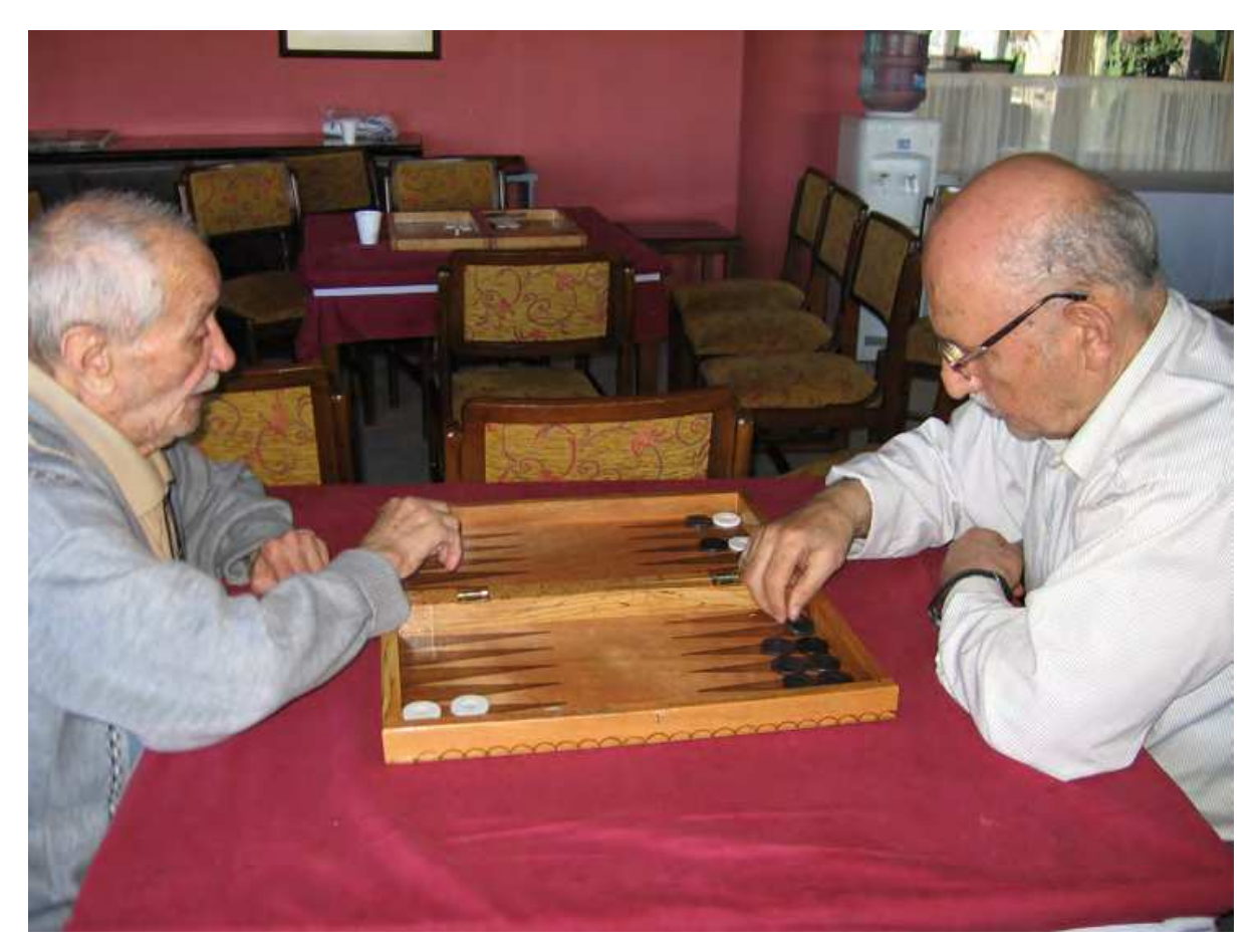
Fig. 1. Backgammon as a cognitive activity for memory strengthening

In ergotherapy, it is possible to increase skills such as spatial orientation, inductive thinking, fluid intelligence, problem solving and memory flexibility by using different methods. The advanced methods of testing and training are expected to contribute more higher-quality, productive and happy aging by reducing the decline in cognitive skills or by emphasizing