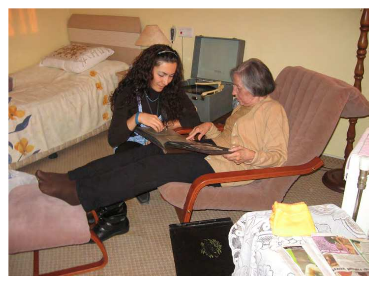
Fig. 6. Reminiscence therapy

One of the primary modalities used to treat depression in the elderly is medicine. However, taking anti-depressants without knowing the underlying reason can cause serious side effects. Therefore, alternative therapies are needed. There are many non-pharmacological treatment methods, such as the real orientation, behavioral therapy, sensory stimulation, music therapy and ergotherapy. Reminiscence therapy is also one of them. It is an effective method to gain self-confidence, socialization, well-being, expression and cognitive function. Reminiscence means discussion with a person or a group about activities, events and experiences done in the past, with the help of photos and / or music archive. The elderly indicate that they feel relaxed when they remember nice memories while looking at photo albums. This method reminds all the elderly of having lived a whole life and it still continues (Royeen & Reistetter, 1996; Stinson & Kirk, 2006; Woods et al., 2005).