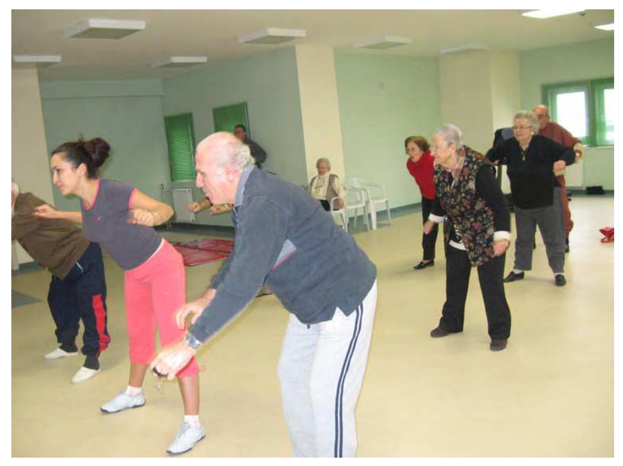
Fig. 4. Older people should participate in physical recreational activities

During lifelong, towards from young adulthood to middle age, interests and desires increase. Having more free time gives a person the opportunity to involve in an activity. But, leisure time activities in the elderly are more passive and home based. The time spent in outside cultural activities is quite less (Crombie et al., 2004). Older people often spend their times by visiting friends, listening to the radio, watching television and reading at their homes (Lee&King, 2003). Outdoor activities such as; sports, going to the theatre and cinema are activities with less continuity. There are some studies showing that this condition and low levels of recreational activity in the elderly are associated with changes in their body function (e.g. excess body mass index), marital status, low education level, male gender, genetic and metabolic factors (Mc Pherson&Kozlik, 1987; Mouton et al.,2000; Strain et al., 2002; Ross,1990).