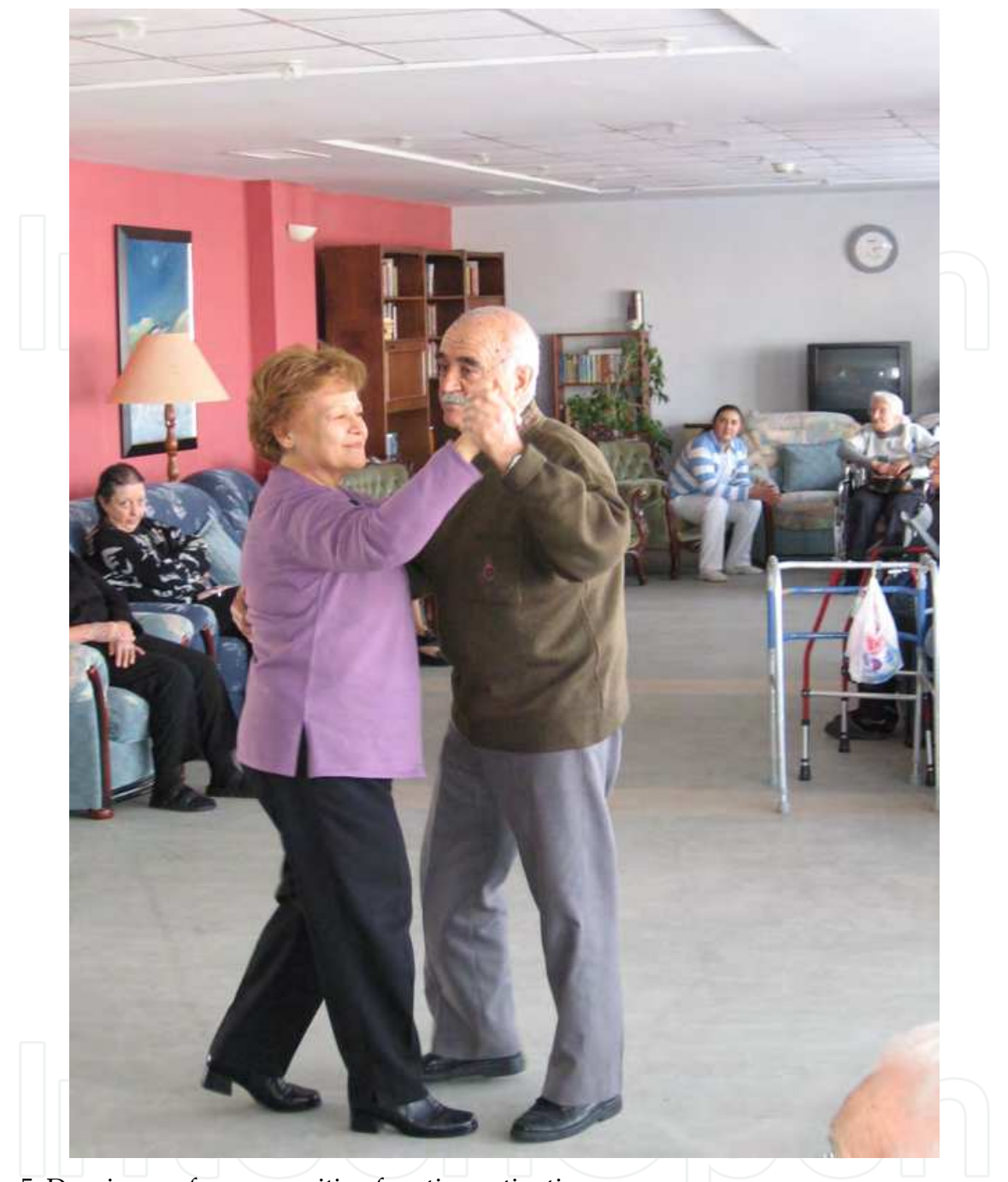
Fig. 5. Dancing performs cognitive function activation

Elderly are the people who are at risk for anxiety and depression. Social participations in activities such as painting, making music and religious meetings protect elderly from these risks (Lynch&Aspnes, 2004). In a study in the UK, it is stated that many activities are not effective as much as participating in religious gatherings that have a significant impact on well-being and quality of life in aged 50-74 (Routasalo et al.; 2007; Warr et al., 2004). Visiting friends and participating in social groups have positive effects on being healthy, having regular physical activities and carrying out ADL independently (Yoshimoto& Kawata, 1996). Reading is recommended in order to organize the behavior of depressive people and remove negative thoughts (Lynch& Aspnes, 2004). Baklien and Carlsson said that visiting a