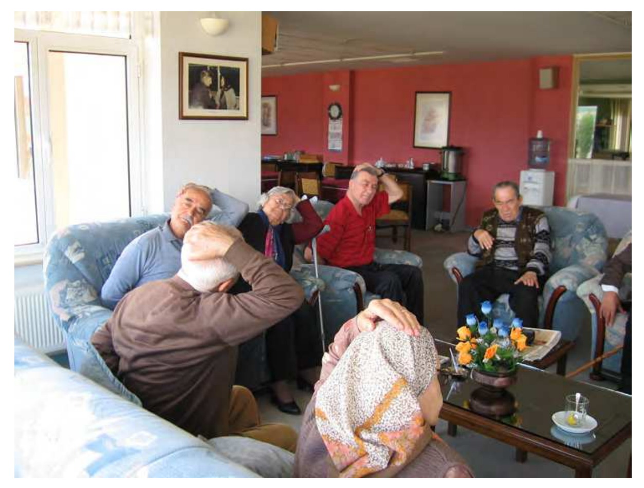
Fig. 7. Group exercise as multi-purpose activities

Ergotherapy plays a significant role to develop the skills in leisure time activities (Glantz, 1996). Ergotherapist explaines the meaning of one's activity by revealing age, gender, role performances, cultural values, wishes and preferences of a person. Evaluation of the special functional activity skills is one of the duty of ergotherapist (Mountain, 2005b). Ergotherapist recommends the elderly activities and social relationships to carry out daily activities, continue existing skills for social integration and gain new skills. Advices to continue a quiet and relax life, listening to the songs of the past, talking to tell, watching the beautiful scenery, being sufficient on maintaining self care, go for shopping, cooking and house cleaning, do sports/water exercises and acquisition of new hobbies are effective for the elderly. Accordingly, these activities help elderly to gain and protect abilities in fields such as communication, cognitive functions or hand motor control. Multi-purpose activity approaches aim to improve special functionality, reintegration activities supported by lifestyle / behavioral and family education, sensory stimulation, encourage the elderly to express themselves and ADL training (Wikstrom, 2004; Yucel et al., 2010).