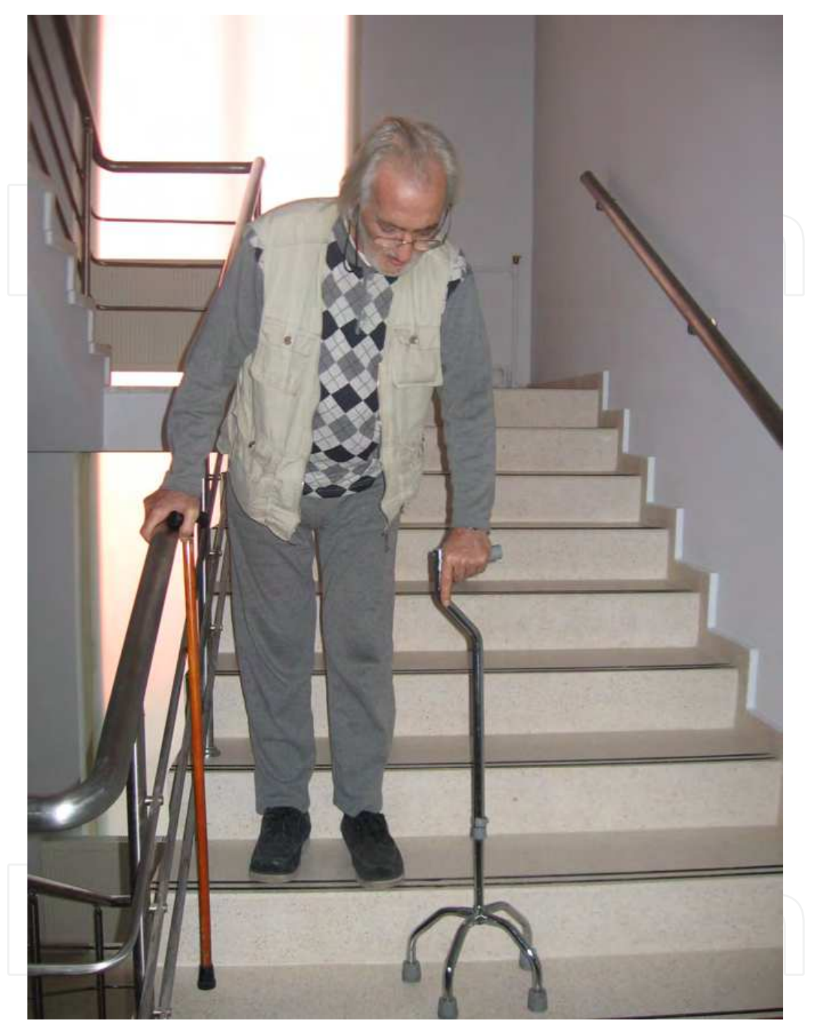
Fig. 3. Ergonomic accessibility with proper devices

Assistive aids such as walker should be suggested to increase stability during walking and to relieve stress in painful joints. An ergotherapist is needed to teach the use of assistive aids and joint protection techniques. Safety modifications and family / caregiver / elderly training reduce dangers. And providing adaptive tools which are necessary for age-related changes, positioning, teaching transfers and ambulation, training about health and prevention techniques and home exercise programs to increase the independence are the major topics of work field of a geriatric ergotherapist (Pu&Nelson, 2004).