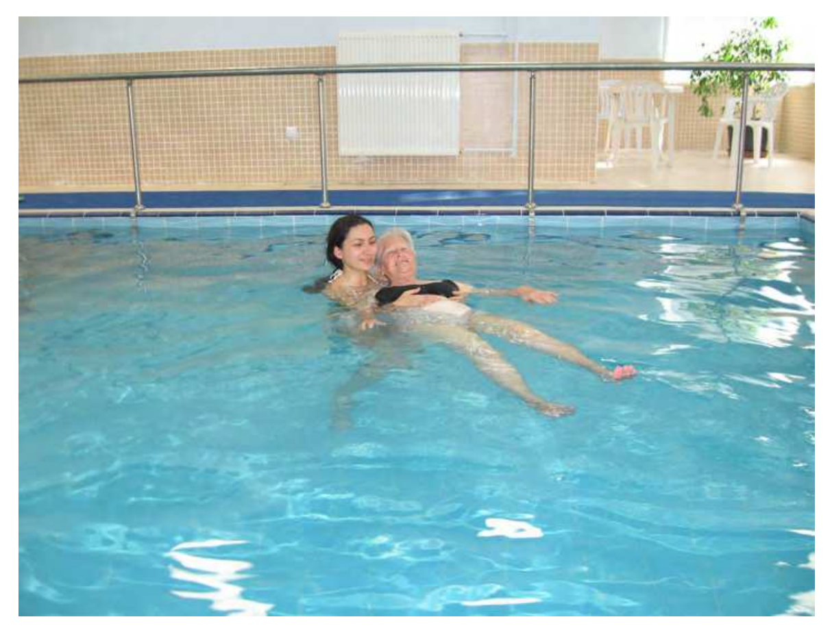
Fig. 8. Water exercises as an activity training method

The effects of multi-purpose activity training in the elderly: