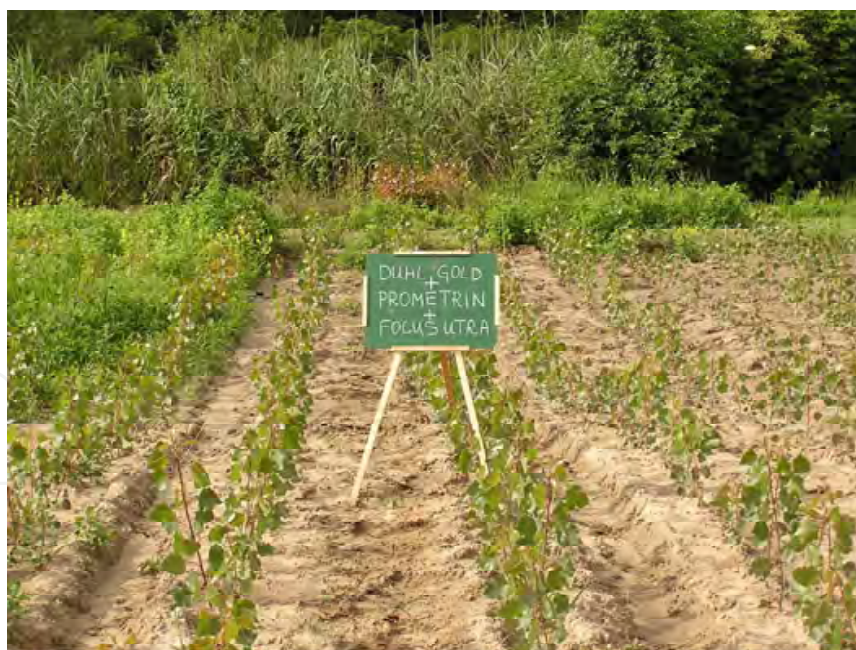
Photo 3. Efficiency of herbicides in nursery production of poplar plants ( Populus euramericana , Populus deltoides )

Pendimethalin – is used for control of many annual grass weeds in production of poplar ( Populus euramericana , Populus deltoides ) nursery plants. It is applied after sowing or planting in quantity of 4 – 6 l/ha depending on soil.