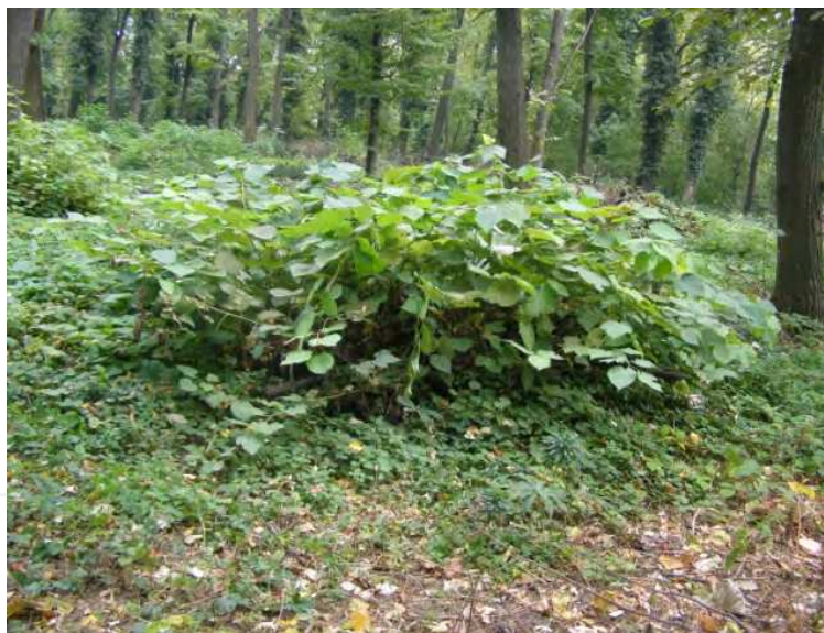
Photo 10. Non treated stumps