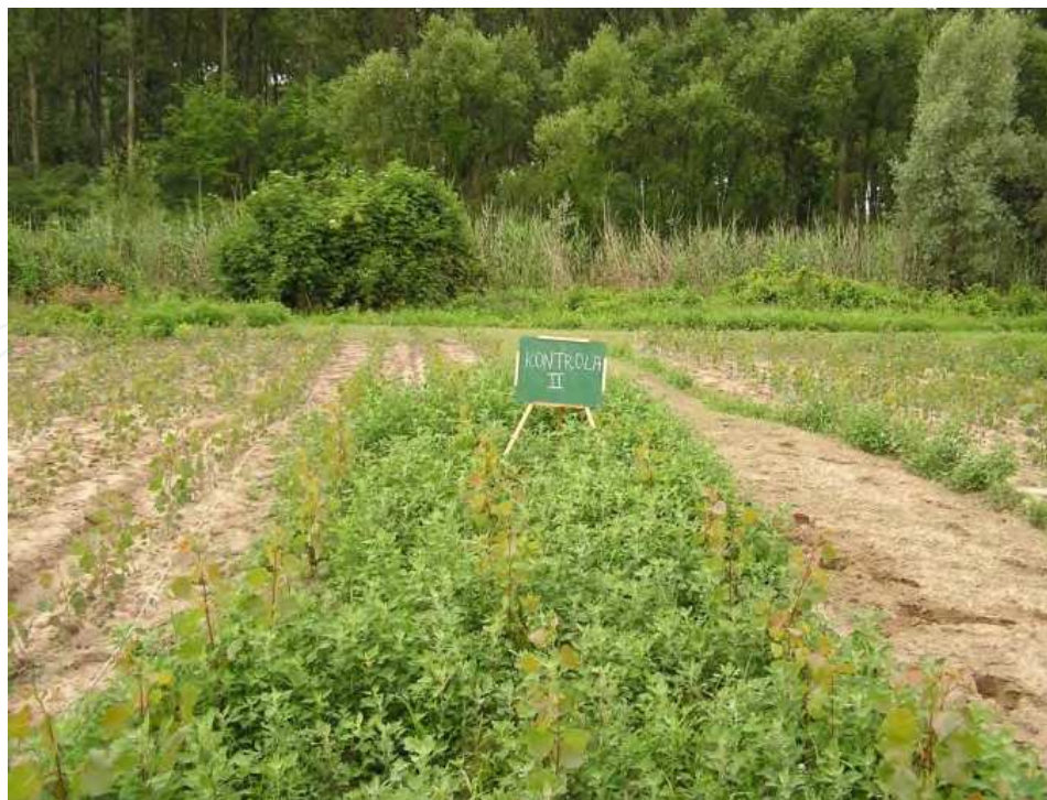
Photo 4. Control plot

S-metolachlor – registered rate is 1,2 – 1,5 l/ha after sowing or planting, and before emergence of weeds and cultivated plants. It is used for control of annual grass and broadleaf weeds in production of poplar ( Populus euramericana , Populus deltoides ), black locust ( Robinia pseudoacacia ), willow ( Salix sp.) and oak ( Quercus robur ) nursery plants.