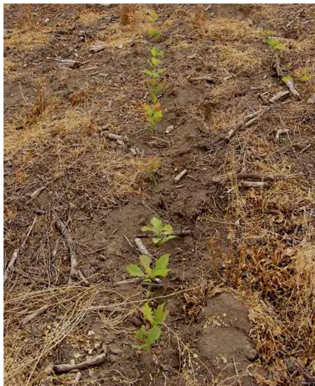
Photo 12. Emergence of oak plants after application of total herbicide