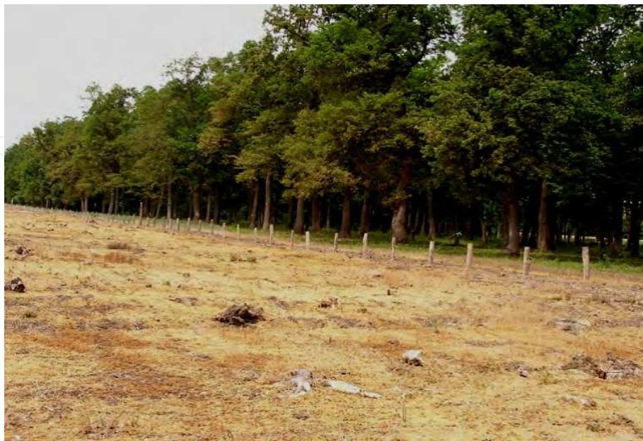
Photo 11. Application herbicides glyphosate after sowing and before emergence of cultivated plants ( Quercus robur )

The most often encountered problem in pedunculate oak forest renovation is Rubus caesius L. (European dewberry) forming impenetrable thickets. Besides blackberry, Crataegus monogyna , C. oxyacantha , and Rosa arvensis may also pose a problem although significantly smaller. Also, if the shoots from stumps are not suppressed they can reach the height of up to 1,5 m, and blackberry and other weeds form thick cover, then the chemical control is difficult to perform due to impenetrability and requires a much higher expenditure of funds.