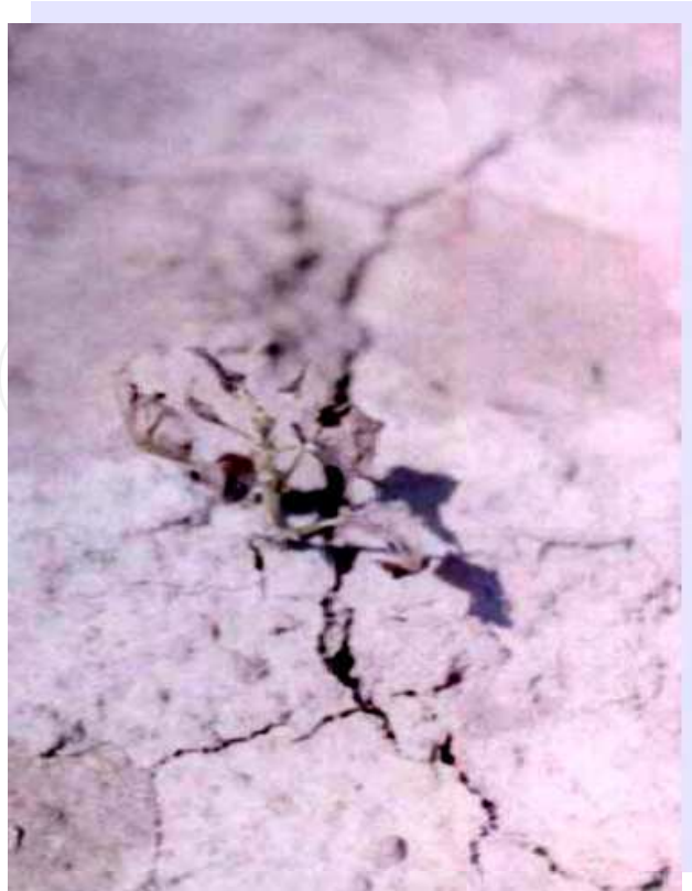
Photo 2. Phytotoxic effect of n poplar seedling ( Populus euramericana , Populus deltoides )