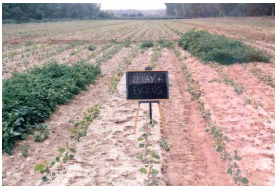
Photo 1. Efficiency of combination of herbicides Acetochlor (Relay plus) and Azafenidin (Evolus 80-WG) in nursery production of poplar ( Populus euramericana , Populus deltoides )

Linuron – is used for soil treatment after sowing or planting, and before emergence of cultivated plants. It is applied in quantity of 2 l/ha in production of poplar ( Populus euramericana , Populus deltoides ), willow ( Salix sp.) and oak ( Quercus robur ).