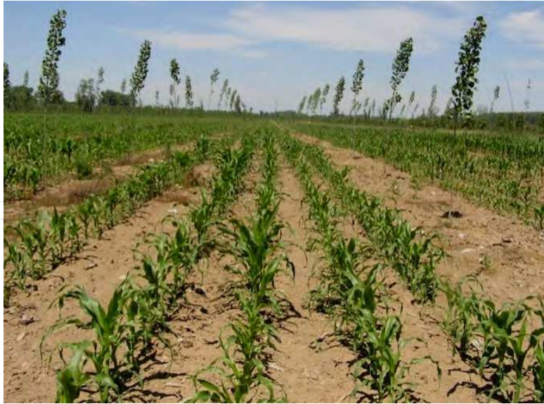
Photo 5. Inter-row sown corn in the poplar plantation