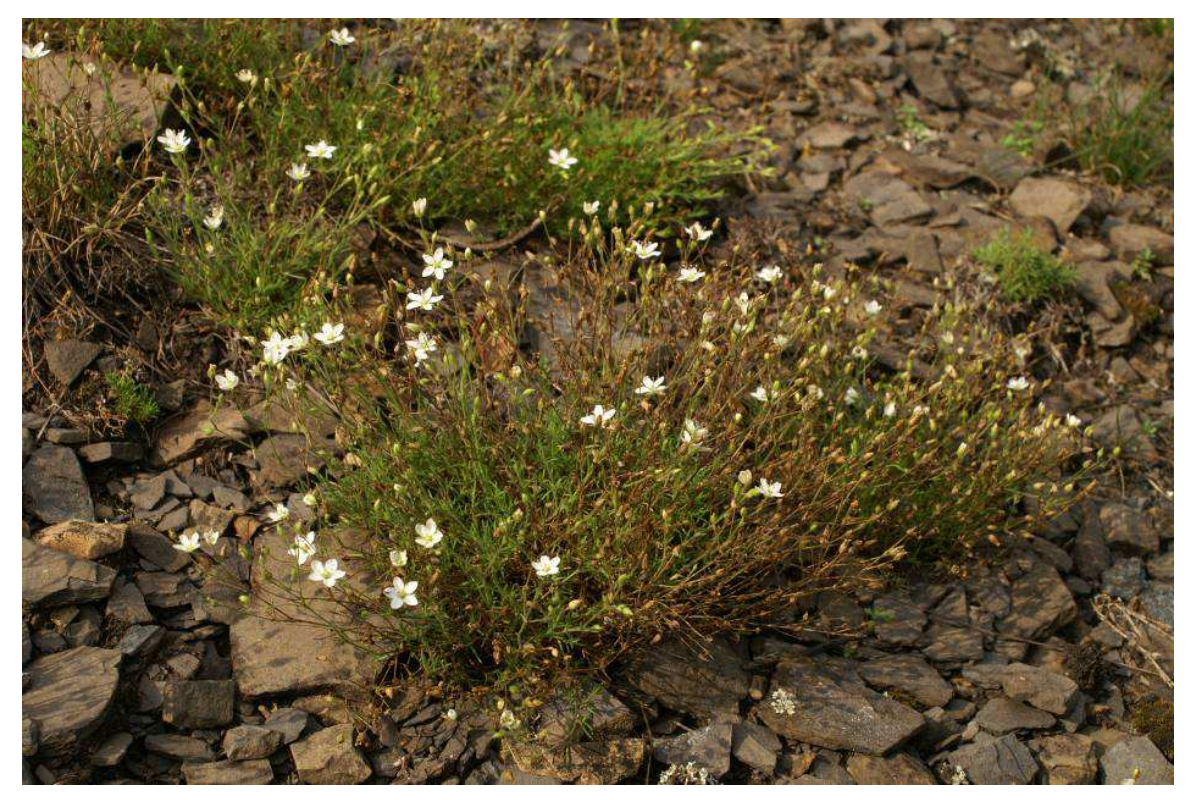
Fig. 2. Minuartia verna , one of the character species of metallicolous vegetation in Central Europe, is critically endangered in some regions due to the loss of habitats.

Minuartia verna is one of the central European character species of metalliferous soil sites that has been considered as glacial relic and therefore paleo-endemics (Schulz, 1912; Schubert, 1954a; Heimans, 1961; Ernst, 1974). Due to the large morphological variation within the Minuartia verna -complex several of the described subspecies and varieties (e. g. Graebner, 1919, Hayek, 1922; Mattfeld, 1922; Halliday, 1964) can only be delineated bio-geographically or edaphically. The necessity of a critical revision of the Minuartia verna -complex has already been postulated by Ernst (1974), nevertheless this revision still is lacking.