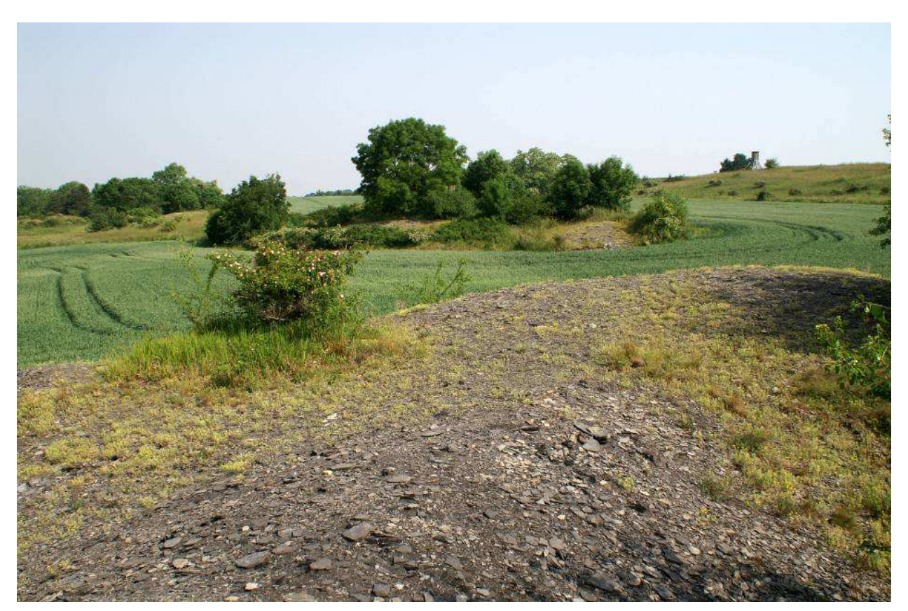
Fig. 4. Spoil heaps of the medieval copper shale mining as secondary metalliferous sites in Central Germany (Dobis, May 2008).

The post-mining landscape consists (state March 2011): in the Mansfeld mining district of 1028 small and 56 large spoil heaps (of which 8 and 12 are slag heaps, respectively), and in the Sangerhausen mining district of 416 small and 9 large spoil heaps (of which 3 and 1 are slag heaps, respectively). Thereby it has to be considered that 60-70 % of the small spoil heaps in the Mansfeld mining district were already destroyed by land burial between 1850 and 1910 (Oertel, 2002). Due to the large amount of metalliferous sites originating in the former copper-mining activities the federal state of Saxony-Anhalt has a particular responsibility towards the preservation of the habitat type 6130. Therefore, three Natura 2000 sites with the habitat type 6130 as the main conservation objective, located in the postmining landscape of the old mines, have been designated (Tab. 3). The total size of these sites is about 687 ha. From this area 137 hectares (19.9 %) are copper-shale spoil heaps with only 21.8 hectares (3.2 %) of calaminarian grassland. Unfortunately, a comprehensive conservation strategy for these sites is not available to date.