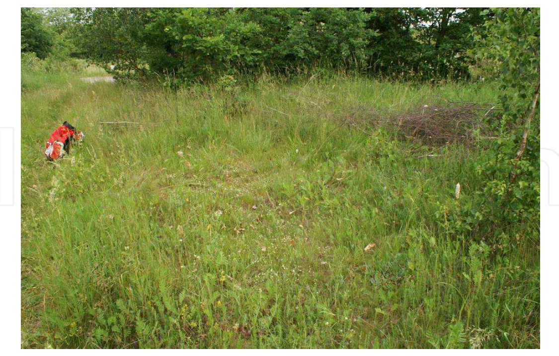
Fig. 5. Primary metalliferous site near Blankenheim (Saxony-Anhalt, Central Germany). This small site is critically endangered by shading and litter input from the surrounding grassland (photograph: H. Baumbach, June 2006).

A third site, located in the east of the village of Blankenheim, was accidentally discovered in 1999 (Fig. 5). The site is subdivided into 5 subareas with a size of only some square metres each (Tab. 4). The soil layer is only 25 cm thick and covers an outcrop of metalliferous sand-ore. Obviously this site was never disturbed by mining activities because sand-ores were not suitable for smelting. Furthermore, this site is located outside the former active mining area. To date this very small site has no conservational state. It is critically endangered by shading and litter input from the surrounding grassland (Arrhenatheretum) and by accidental destruction. The genotypes of the Minuartia verna -population growing at this site have both characters of the alpine populations and characters of the spoil heap populations (Baumbach, 2005). This indicates that the M. verna -population has survived on this site since the last ice age and is therefore a real paleo-endemic.