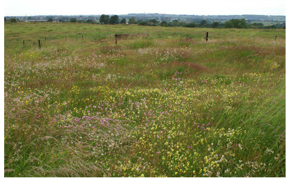
Fig. 1. Metallicolous vegetation with the character species Armeria maritima, Viola calaminaria, Minuartia verna and Silene vulgaris near Rabotrath (Belgium, photograph: H. Baumbach, June 2008).

copper-shale mining region of Mansfeld and Sangerhausen (the eastern Harz Mountains foothills region, Saxony-Anhalt, Central Germany). Despite the legal protection and several conservation efforts, the number of metalliferous soil sites with their unique flora has decreased in several regions substantially. Therefore, I want to encourage a supra-regional conservation strategy for Central European metalliferous sites.