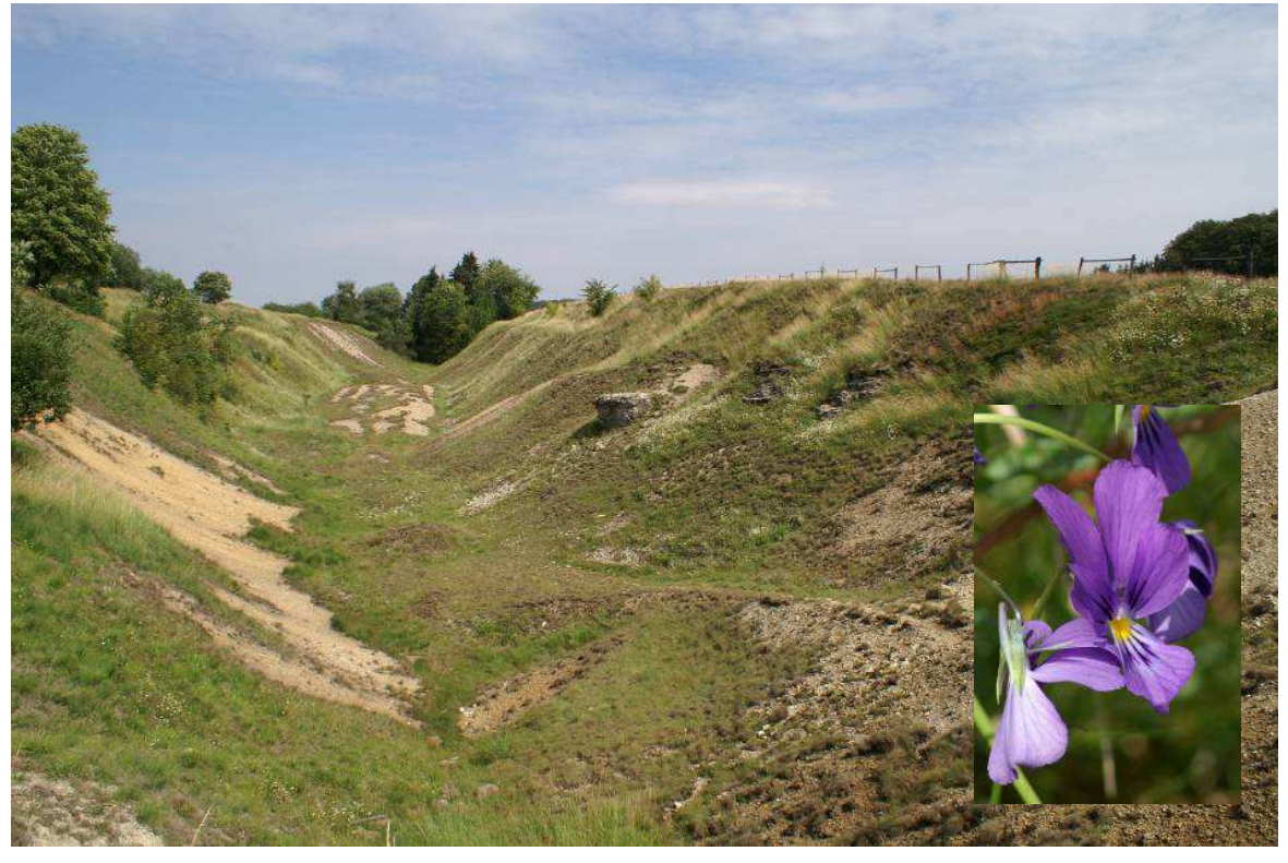
Fig. 3. Old lead-zinc opencast mining near Blankenrode (Germany), type locality of Viola guestphalica (small picture), the Westfalian zinc violet.

Cardaminopsis halleri (L.) HAYEK (Brassicaceae) is a wide-spread pseudo-metallophyte which occurs at metalliferous and non metalliferous sites (meadows, watersides, rocks). The genetic structure of 28 metallicolous and non-metalicolous populations with a total of 625 individuals was studied by Pauwels et al. (2005) using PCR-RFLP on chloroplast DNA (cpDNA). Eleven distinct chlorotypes were found: five were common to non-metallicolous and metallicolous populations, whereas six were only observed in one edaphic type (five in non-metallicolous and one in metallicolous). No difference in chlorotype diversity between edaphic types was detected. Computed on the basis of chlorotype frequencies, the level of population differentiation was high but remained the same when taking into account levels of molecular divergence between chlorotypes. Isolation by distance was largely responsible for population differentiation. As it was the case in Silene vulgaris (Baumbach, 2005) geographically isolated groups of metallicolous populations were more genetically related to their closest non-metallicolous populations than to each other. These results suggest that metallicolous populations have been established separately from distinct non-metallicolous populations without suffering founding events and that the evolution towards increased tolerance observed in the distinct metallicolous population groups occurred independently.