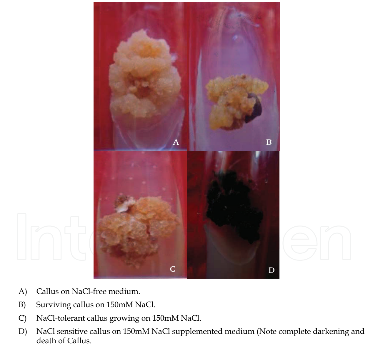
Table 4. Effect of growth regulators on Frequency, Number of shoots, and mean shoot length from cotyledon derived callus in Vigna radiata .

Data represents average of three experiments. Mean ± standard error. Mean followed by the same superscript in a column is not significantly different at P= 0.05 levels.