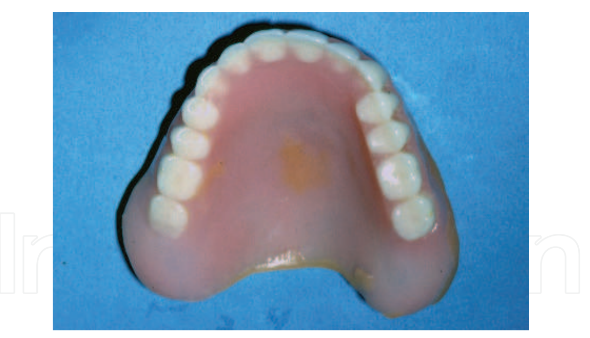
Fig. 4. Acrylic upper complete denture

Complete dentures have been used for over a hundred years. The ubiquitous acrylic resin dentures (Figure 4), which came into use in the early 1950s, are now commonly used all over the world. They are generally affordable, well-tolerated by patients and simple to fabricate.