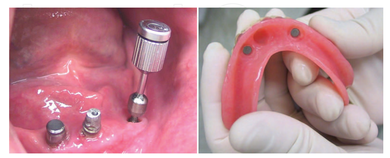
Fig. 5. Implant-retained mandibular complete denture

One of the main problems with dentures is the retention of the mandibular denture as the bony ridges which support the prostheses in the lower jaw tend to be highly resorbed with increasing age. Osseointegrated dental implants, first introduced in the late 1950s in an experimental way, are now readily available at most dental practices and their costs are no longer overly prohibitive. The implant retained lower complete denture (Figure 5) is fast becoming the prosthesis of choice and almost synonymous with the expected standard of