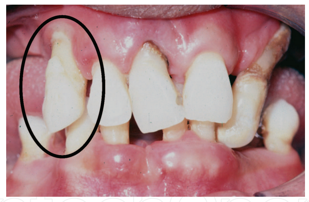
Fig. 1. Gingival recession (circled) increases the risk of root caries

Dental plaque is a key contributing factor in the aetiology of dental caries and periodontal disease. This composite of saliva, partially digested food and bacteria sticks to the tooth surfaces. Acidic by-products of bacteria metabolism causes erosion of the tooth structure giving rise to dental caries. The elderly with lower masticatory ability tend to consume carbohydrate-rich foods and this exacerbates a vicious cycle for dental caries as such foods are excellent bacterial substrates in the oral cavity. In general, oral health has generally improved over the years and the prevalence of edentulism has decreased. 9 With more teeth in the mouth over a longer period of time, it is unsurprising that the incidence of dental caries is higher among the elderly. Gingival recession (Figure 1), common with increasing age, also puts teeth at increased risk for root caries.