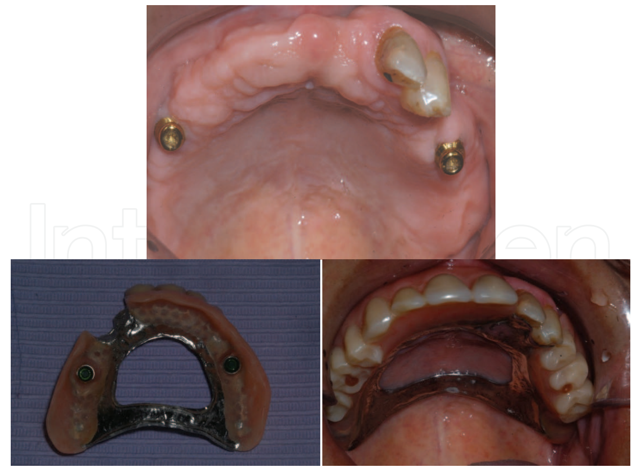
Fig. 6. Implant retained maxillary partial denture