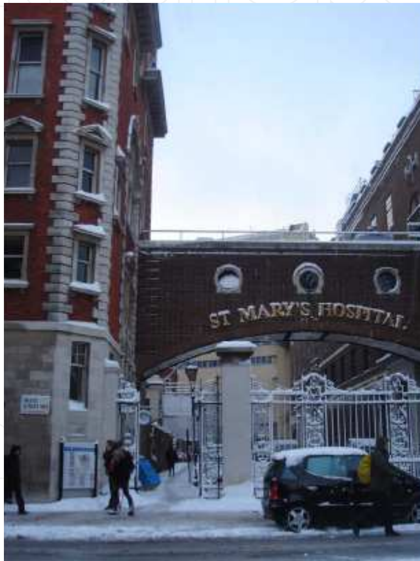
Fig. 2. Actual image of the St.Mary's Hospital in London, UK. Wright directed the former Inoculation Department of this hospital, devoted to administer the vaccines therapeutically.

Therapeutical vaccinations also lead him to the observation of an immediate aggravation of the patient's condition, what he called the "Negative Phase" (Wright 1902).