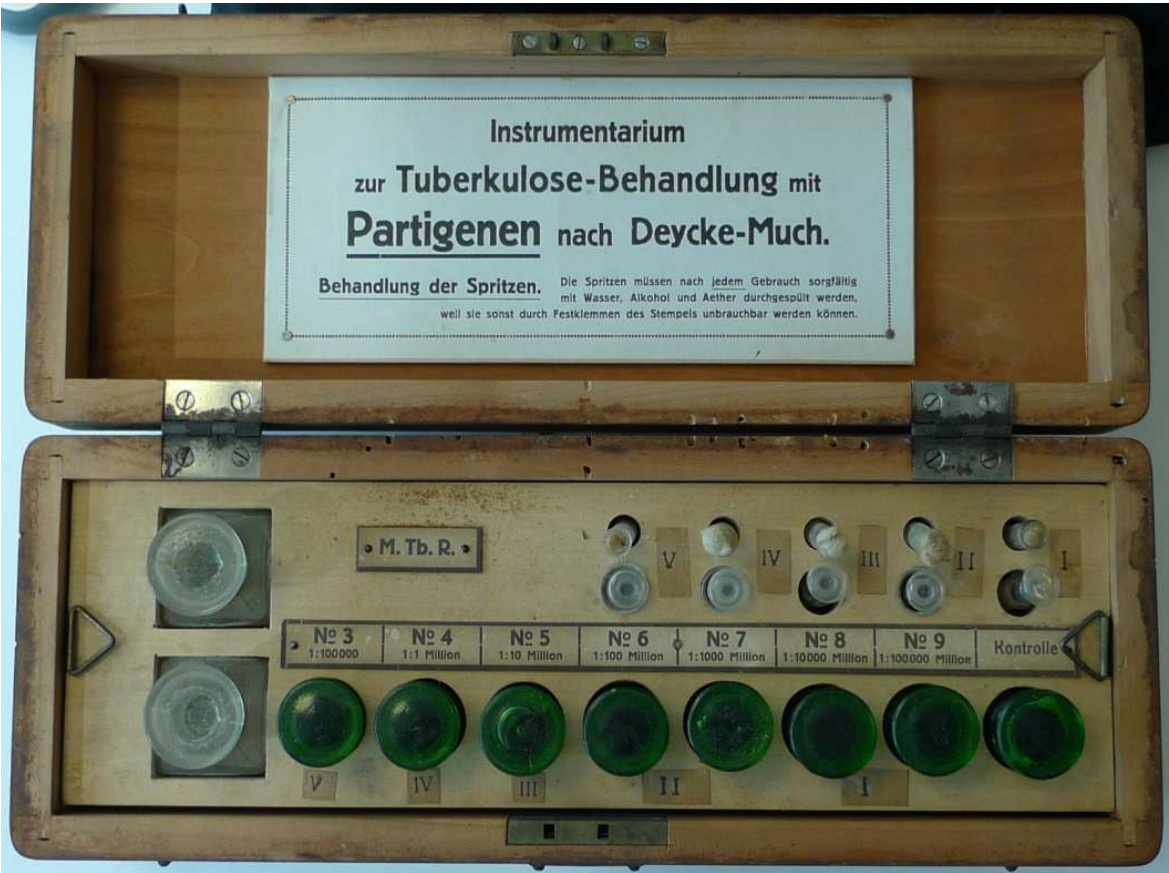
Fig. 1. Partigens of Deycke-Much.

The main problem of the products was its preparation, as they all required dilutions and these were performed by the physicians themselves, a fact that the manufacturer of the Beraneck tuberculin improved (as its dilutions could be already provided) ensuring a better uniformity of concentration (Sahli 1912). The concentration was important to graduate the doses of the vaccines, and this was indispensable to be able to organize to time the injections (Wright 1902).