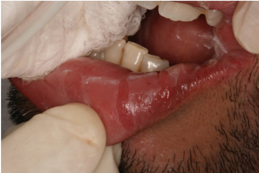
Fig. 1. Clinical presentation: A patient in a coma state showing intense dry lip mucosa

chew and swallow dried food without water; by quantifying the volume of residual saliva on mucosal surfaces using filter paper and micro-moisture meter and calculating thickness; and mucosal wetness devices (Osailan et al., 2011). Also, sialometry (salivary flow rate measurement) is indicated as part of the diagnostic procedures for hyposalivation (Tenovuo & Lagerlöf, 1994), and the composition of saliva can be verified by means of biochemical salivary exams.