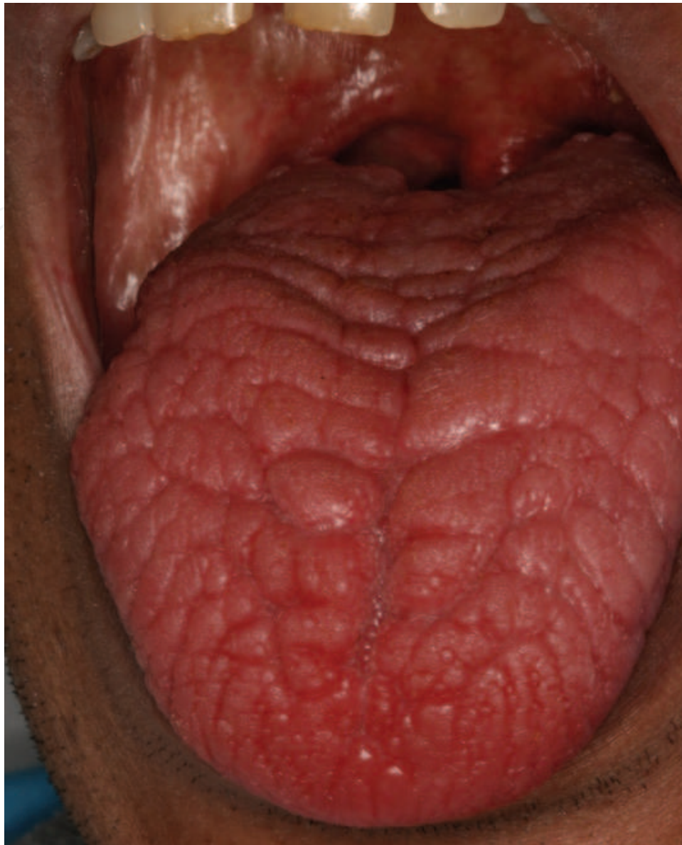
Fig. 3. Clinical presentation: A patient treated with medication showing tongue with atrophied papilla and deep fissures

Antidepressants have anticholinergic or antimuscarinic action, which acts to block the actions of the parasympathetic system by inhibiting the effects of acetylcholine on the salivary gland receptors. This results in a dry mouth sensation, probably because the sympathetic portion of the independent nervous system predominates over the “blocked” parasympathetic system (Wynn et al., 2001). According to Schubert & Izutsu (1987), the drugs may affect the salivary flow and its composition by interferences in the acinary and duct functions, and by means of alterations in the blood flow of the salivary glands. According to Douglas (2002) diminishment of the salivary flow is due to the reduction in the blood flow of the gland, produced by adrenergic sympathetic vasoconstriction. Therefore, when there is sympathetic hyperactivity the mouth presents dry.