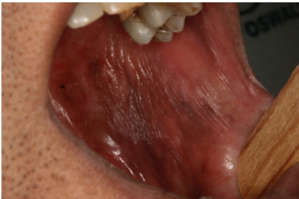
Fig. 2. Clinical presentation: A patient showing dry mucosae after use of medications