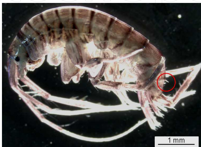
Fig. 1. The estuarine sentinel species of eastern Australia, the amphipod Melita plumulosa . The distinguishing morphological feature of this species is the additional posterodorsal spine on urosomite 1 (circled in red).

making sampling time-consuming and correct identification crucial. Therefore, the applicability of this organism as a global sentinel species across Australian waterways is limited. A second disadvantage of M. plumulosa is the variability in female fecundity (Gale et al., 2006; Mann & Hyne, 2008). Female fecundity is a commonly assessed organismal endpoint of toxicant exposure in M. plumulosa , and is closely linked with dietary fatty acid composition which is crucial to ovary maturation and embryo development in amphipods and other crustacea (Clarke et al., 1985; Hyne et al., 2009; Middleditch et al., 1980). Recently, fine-milled silica has been shown to be a feasible alternative standardised substrate for short term toxicity tests; however, field collected sediments are still necessary for both long term tests and laboratory culture maintenance (Mann et al., 2011).