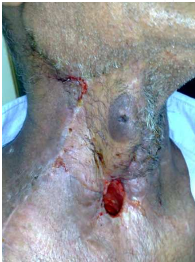
Fig. 2. Pectoralis major flap for coverage of exposed carotid artery

Complications involving the common carotid artery are the most feared sequelae of neck surgery. Acute postoperative carotid artery rupture, or "blow out" occurs in 3% to 4% of radical neck dissection and associated with a mortality rate of 50%. Factors associated with carotid artery hemorrhage include wound breakdown, necrosis, and infection, pharyngocutaneous fistula, prior radiation therapy, tumor involvement of the arterial wall. Tumor invasion of the carotid artery is a relatively uncommon event of advanced aggressive disease or revision surgery for a recurrent neck mass(4).when wound dehiscence results in the exposure of the carotid artery,it is more ominous, and its management more critical.(fig2)