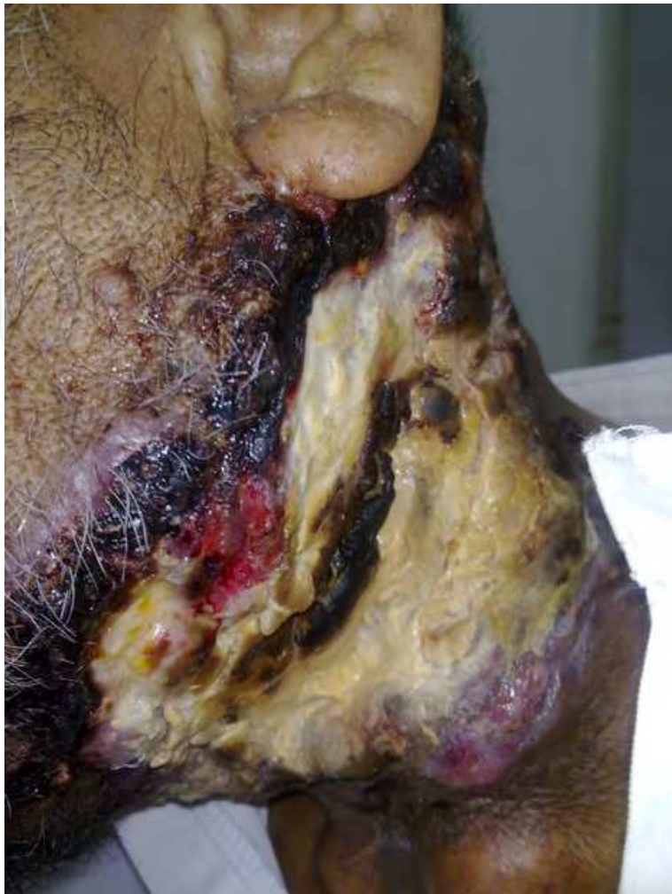
Fig. 1. Wound infection and necrosis

on the SCM during flap elevation, and the decision of whether to preserve it can be made later. Sacrifice of this nerve during neck dissection leads to a sensory deficit of the auricle that usually diminishes with time. Neuroma of divided greater auricular nerve can occur(10).