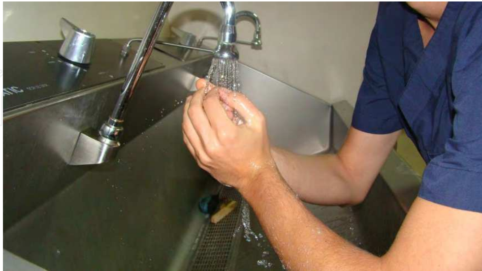
Fig. 1. Hands should be washed before and after all procedure.

publications hands must be washed with antimicrobial soaps before and after invasive procedures performed on patients. At times when washing hands is not an option, application of water-free antiseptics is recommended.