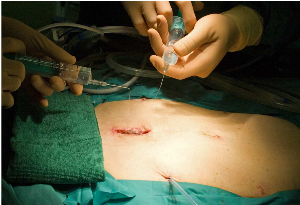
Fig. 1. Before closure of the abdomen during surgery, high-pressure irrigation of the subcutaneous tissue after muscle layer suturing

mL for laparoscopic surgery. After irrigation, the skin was closed with polydioxanone absorbable sutures (4-0 PDS II™, Johnson and Johnson Co., Ltd.).