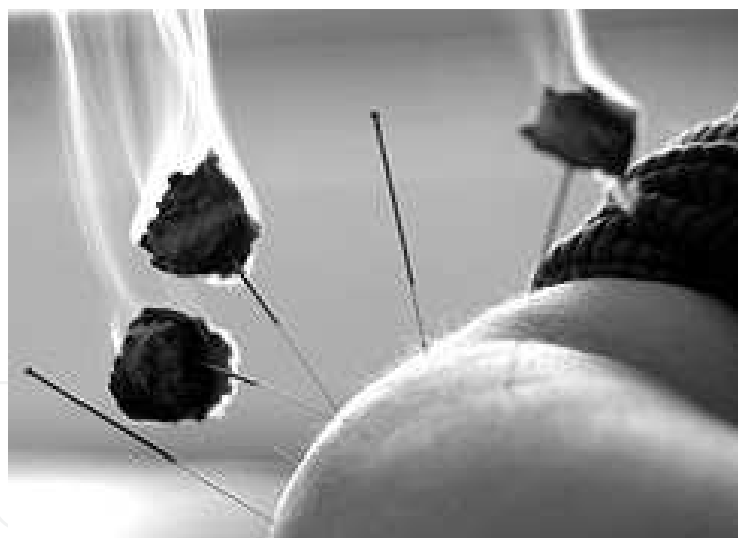
Fig. 6. A pattern of warming needle moxibustion

Yang (Zhang, 2008, as cited in Yang, 2002) used moxibustion with warming needle to treat 32 cases of simple obesity of deficiency type by selecting qi-hai, guan-yuan, zu-san-li, tian-shu, yin-ling-quan, and san-yin-jiao as the main points and secondary points according to differentiation of symptoms and signs. Following the arrival of qi, 1-2 lighted moxa sticks about 2 cm in length were consecutively put on the handles of the needles of the 2-3 main points, and the other needles were retained as usual. The treatment was given 6 times weekly, and 30 sessions constituted a therapeutic course. A total effective rate of 90.6% was achieved after one course of treatments.