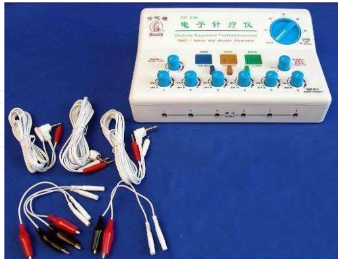
Fig. 5. An electric apparatus for electroacupuncture stimulation

libitum. A significant reduction of the body weight accompanied by a reduction in food intake was observed. 2 Hz EA was more effective than 100 Hz EA (Tian et al., 2005).