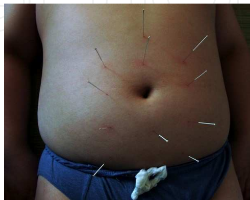
Fig. 2. Acupuncture being applied to the abdomen

Very basically, acupuncture is the insertion of stainless steel filiform needles into precisely specified acupoints on the body's surface, in order to influence physiological functioning of the body.