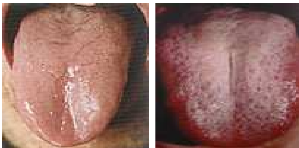
Fig. 1. Changes of tongue coating in different types of fat person(ICMHL, Shen-Nong Info.b)

Liver stagnation caused by prolonged strong emotions or depression leads to disharmony between the spleen and the liver and gives rise to fluid retention. Due to the liver being depressed, the gall bladder is also depressed and exhausted; the ebb and flow of these organs become unbalanced, and the qi mechanism does not flow freely. Hence fat turbidity is difficult to be transformed and over time it leads to obesity.