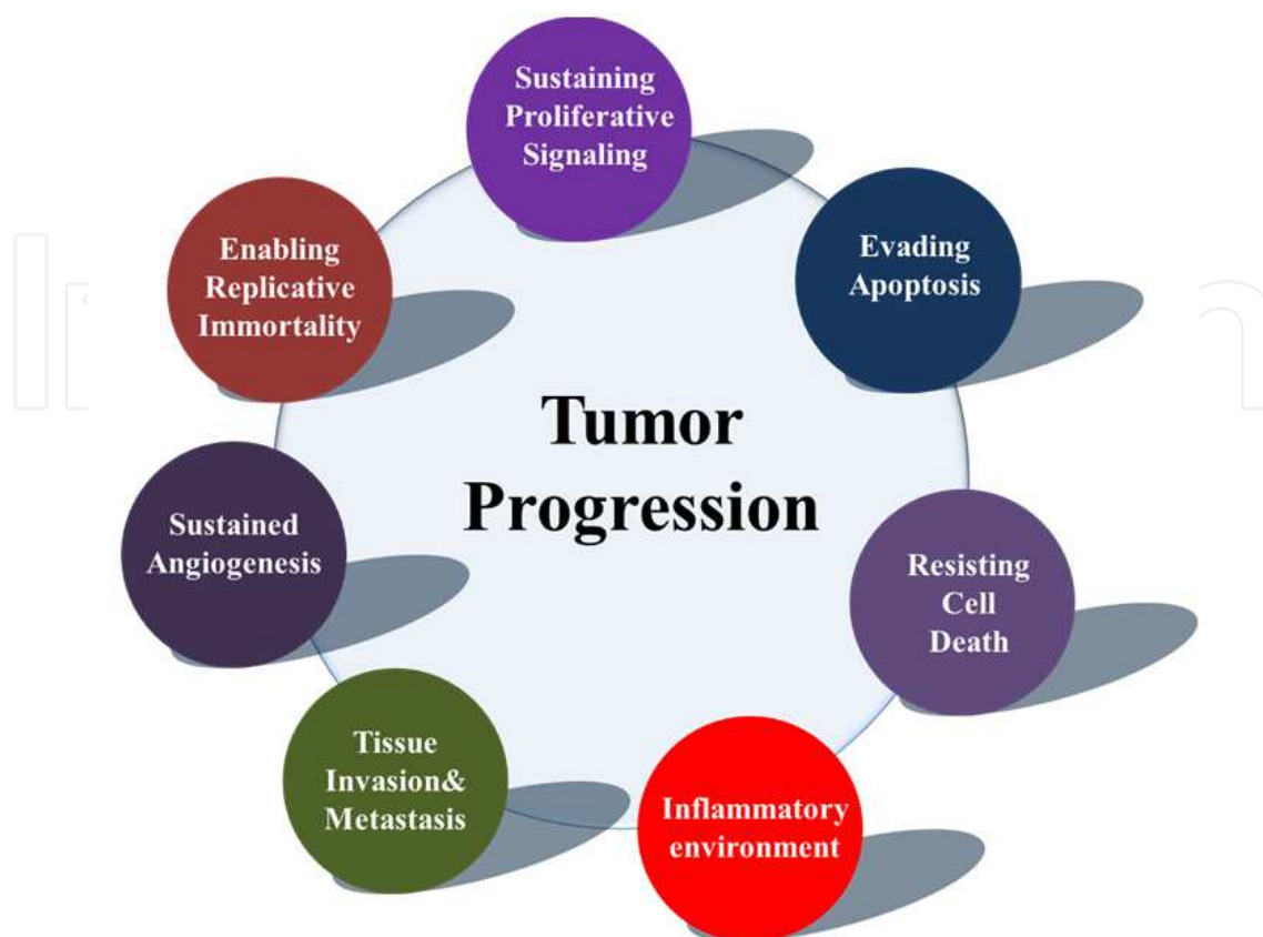
Fig. 1. Hallmarks of cancer [1].