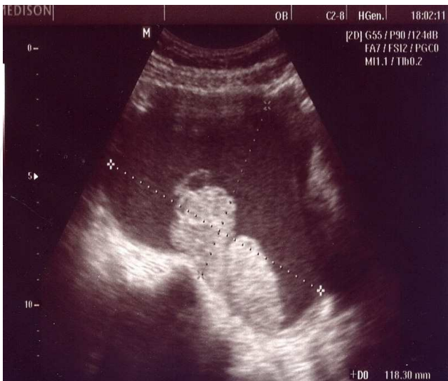
Picture 1. Transabdominal ultrasonography of 44 year-old, single woman with palpable pelvic mass has shown mixed solid cystic mass sized 11.8 cm. Postoperative pathologic diagnosed clear cell adenocarcinoma of ovary, FIGO stage IC.

ovarian cancer. A number of tumor markers were detected only in late staged of cancer as shown in table 3.