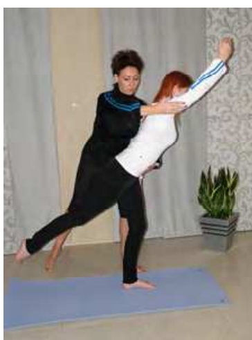
Fig. 7. Execution of strong core with body alignment before and during movement

One of the major emphases of Pilates is to address the posture of the pelvis by addressing the musculature of the pelvis. Pilates further corrects this imbalance by placing a strong emphasis on stretching the low back musculature. In this manner, Pilates aims to create a neutral pelvis, and thereby create a healthy lumbar lordosis. (Muscolino & Cipriani, 2004 as cited in Selby, 2002; Siler, 2000; Winsor, 1999).