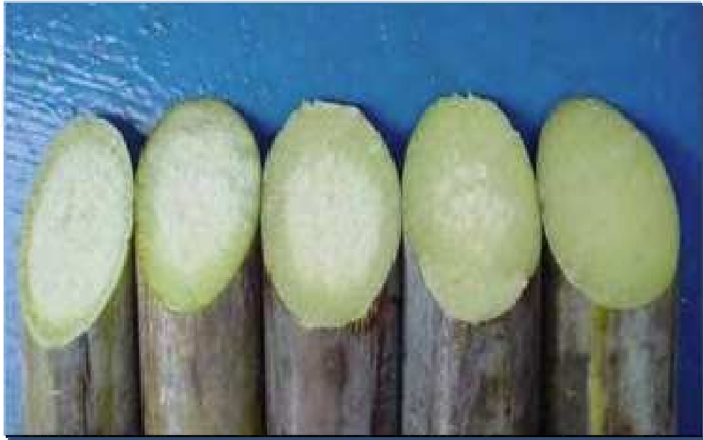
Fig. 2. Different grades of pith process in sugarcane. From the left to the right, intense pith to no pith.

Quantification of the degree of the pith process and the possible changes in the quality of the raw material may provide critical data to the design of the area to be planted for each variety and the best time periods for industrial use. The intensity of the flowering process and its consequences for the quality of raw materials vary with the variety and climate. Therefore, reducing the amount of juice is the main factor that is affected by flowering.