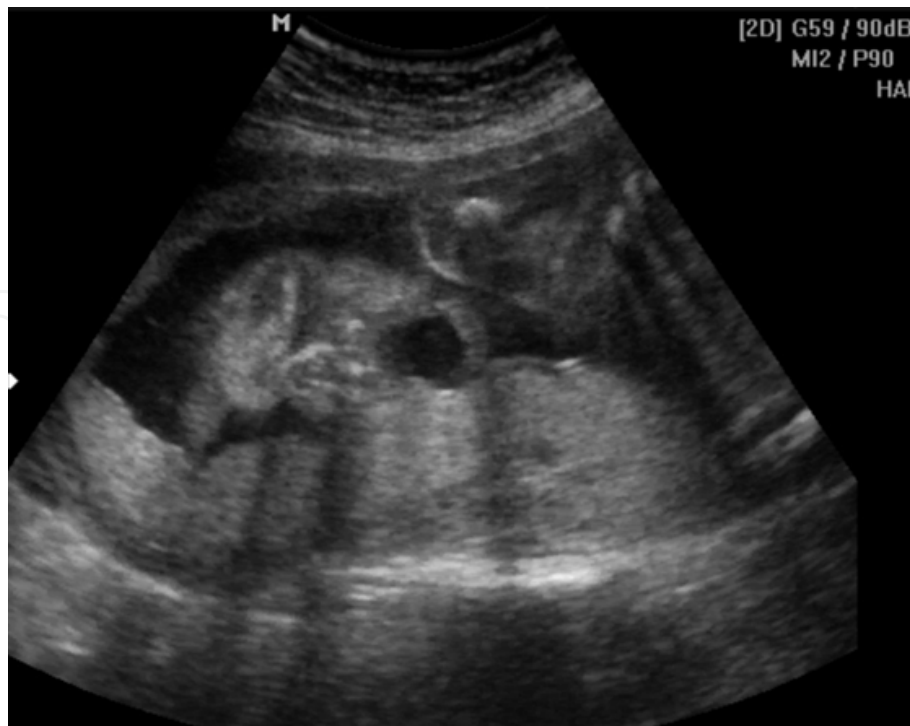
Fig. 4. Fetal yawn at 23 weeks of pregnancy (2D). Fetus weighing 200g

longitudinal fasciculus (MLF), pontine tegmentum, raphe nucleus and locus coeruleus, which exert widespread influence on arousal, including the sleep-wake cycle. Therefore, these structures exert tremendous influence on gross body movements, head turning, heart rate, and respiratory movements, as well as swallowing, yawning, suckling, hiccups, and 7 facial grimacing movements (Santagati, 2003; Kontges, 1996; Jacob, 2000; Sadler, 2009) (Fig. 1).