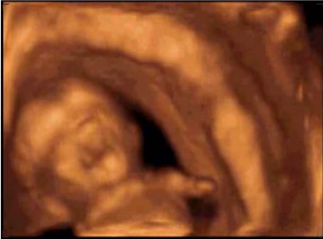
Fig. 2. Fetal yawn at 12 weeks of pregnancy (3D). Fetus weighing 80g