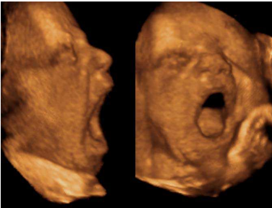
Fig. 3. Fetal yawn at 23 weeks of pregnancy (3D). Fetus weighing 200g