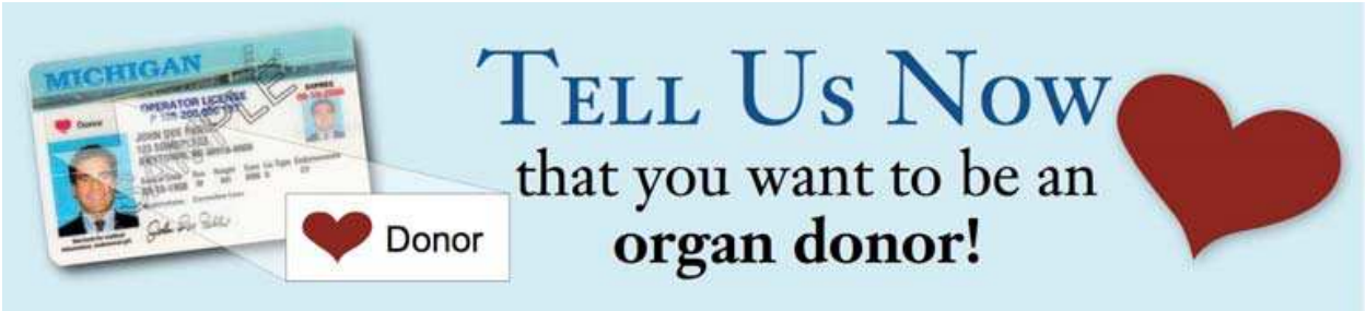
Fig. 3. Counter Mat