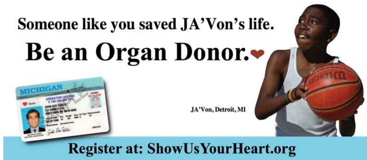
Fig. 4. Sample Billboard

A final component to the intervention consisted of an interpersonal intervention where volunteers associated with the local organ procurement organization (OPO) covered shifts in branch offices to talk to members of the public about joining the registry. Most volunteers had been touched by organ donation, either as recipients, in need of a transplant, or donor family members. The interpersonal component occurred during months 3 and 4 of the 6-month intervention. During these two months all other elements of the campaign (POD, mass media) were also included. All volunteers underwent specialized training that was modified from the Kentucky project and from two previous worksite campaigns (Morgan, Stephenson et al. 2010; Morgan, Harrison et al. 2010). The training was necessary because simply being touched by donation does not mean an individual knows all of the facts about donation or the best ways to talk to the public about donation. Volunteers wore “uniforms” with polo shirts displaying the “Tell Us Now” logo. Volunteers were placed in branch offices for four four-hour shifts per week and greeted every individual who entered DMV branch offices, handed them a “clerk card”, and if any individual showed extra interest or had questions, talked to them about organ donation.