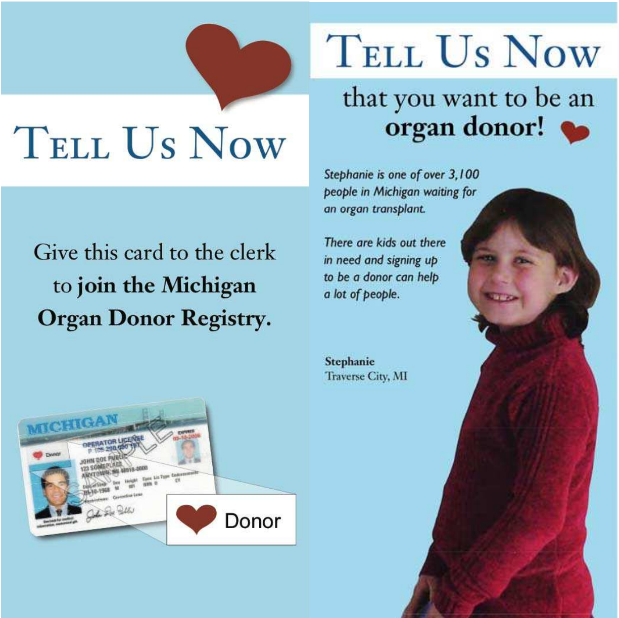
Fig. 2. Example of Clerk Card Front and Back