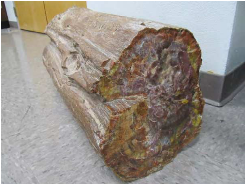
Fig. 4. The Dunn-Seiler Museum at Mississippi State University displays several specimens of petrified wood, including this fossilized log that is available for hands-on investigation.