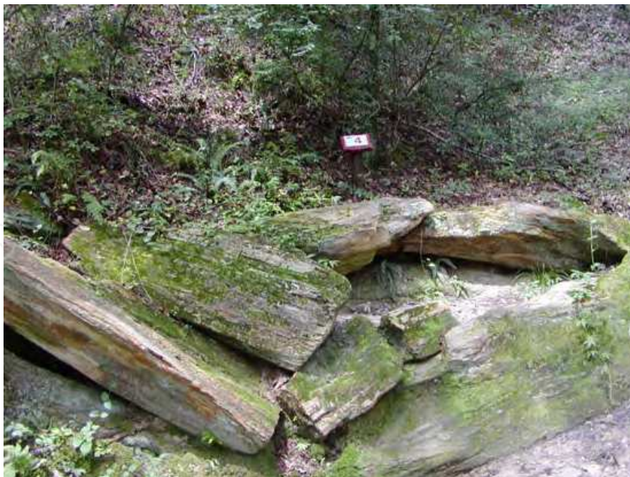
Fig. 1. The Mississippi Petrified Forest in Flora, MS has the largest public display of petrified wood east of the Mississippi River in the US. Signage is minimal at the site, but visitors are provided a brochure, which offers descriptions of the numbered waypoints. The fossilized wood on display is Oligocene in age (30 million years old).

We identified several opportunities to learn important scientific constructs in these informal learning environments, but noted that geologic time was not emphasized or was avoided on the self-guided trails. Likewise, scientific explanations of the formation of petrified wood were missing, partial, or incorrect. However, opportunities existed to help the public visualize how the current location differed from the past paleoenvironment in which the fossilized trees originally lived, and how scientists arrived at the ages for the fossilized wood specimens preserved at each site. A context of the displayed fossilized trees within a larger context of plant evolution would have been informative and helpful.