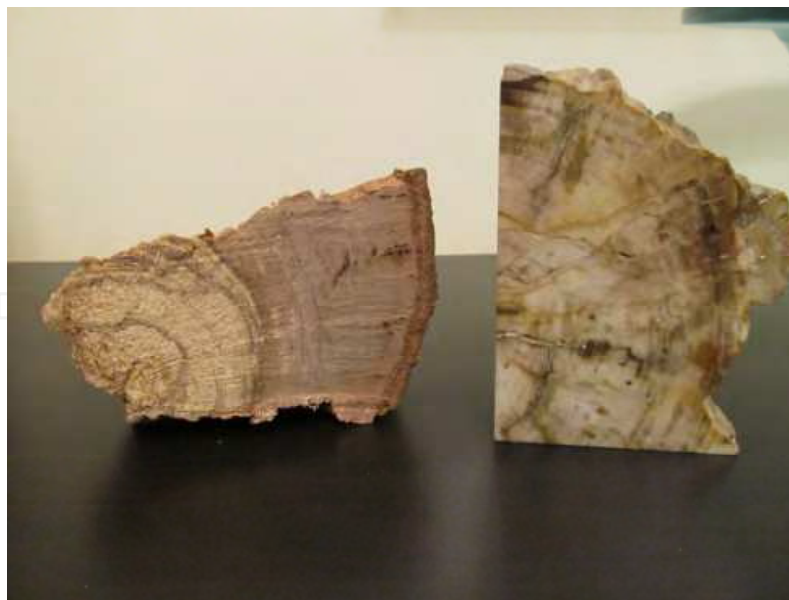
Fig. 5. Teacher groups were provided hand samples of cut and polished petrified wood (right) and a cut modern log (left) for comparison.

Because not all teachers have direct access to petrified wood samples, we introduced and field-tested a simple activity to mimic the fossilization process that involved Epsom salts and a paper towel. We provided teachers with a simple laboratory procedure from TOPS Learning Systems (n.d.). On a small plate, 14.7 cm 3 of MgSO 4 (one level US tablespoon) is dissolved in 29.6 ml (2 level US tablespoons) water. A paper towel is folded into quarters, and then rolled up loosely to form the “log.” This paper log is placed in the salt mixture, and allowed to dry over time. The salt solution is drawn into the paper towel log, and the MgSO 4 precipitates as the log dries. We previously enlisted middle school students (Fig. 6)