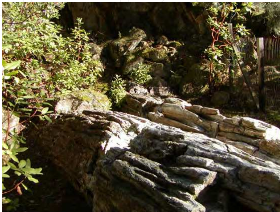
Fig. 2. The Petrified Forest in Calistoga, CA is noted for the druzy quartz crystals within the fossilized wood specimens. Brochures are used in lieu of signage at this site. A tourist site since 1871, the Petrified Forest displays fossilized wood from the Pliocene, approximately 3 million years in age.

The fact that both forests have drawn the public since 1871 (California) and 1854 (Mississippi) provides convincing documentation of the value of petrified wood and petrified forests for teaching geobiological literacy. Our investigation into the visitors' comments (Fig. 3) revealed that although visitors were awed by the display of the fossilized trees, several visitors invoked non-scientific views to explain their formation and presence at the site.