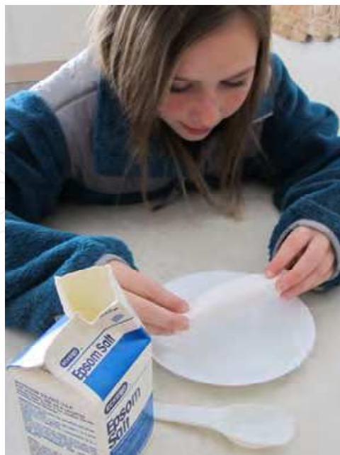
Fig. 6. A middle school student (US grade 7) uses the TOPS Learning Systems (n.d.) petrified paper activity to replicate the fossilization of wood.

Because not all teachers have direct access to petrified wood samples, we introduced and field-tested a simple activity to mimic the fossilization process that involved Epsom salts and a paper towel. We provided teachers with a simple laboratory procedure from TOPS Learning Systems (n.d.). On a small plate, 14.7 cm 3 of MgSO 4 (one level US tablespoon) is dissolved in 29.6 ml (2 level US tablespoons) water. A paper towel is folded into quarters, and then rolled up loosely to form the “log.” This paper log is placed in the salt mixture, and allowed to dry over time. The salt solution is drawn into the paper towel log, and the MgSO 4 precipitates as the log dries. We previously enlisted middle school students (Fig. 6)