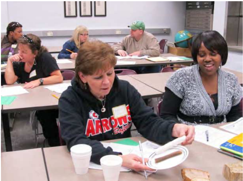
Fig. 9. Inservice teachers in the TANS1 geosciences group investigate the petrified paper activity. In this photo, teachers are trying to determine why a sample “log” made from coarse brown paper did not dry properly when compared to the petrified paper log.

In June 2011, we surveyed teachers who participated in a different professional development program, which consisted of four weeks of instruction for the integration of mathematical and science content. Ten elementary teachers participated, and constitute the group ELE1. The Petrified Wood Survey™ was administered, and fossilized and modern wood samples were provided for comparison. Because of time limitations, the full hands-on investigative activities were not conducted.