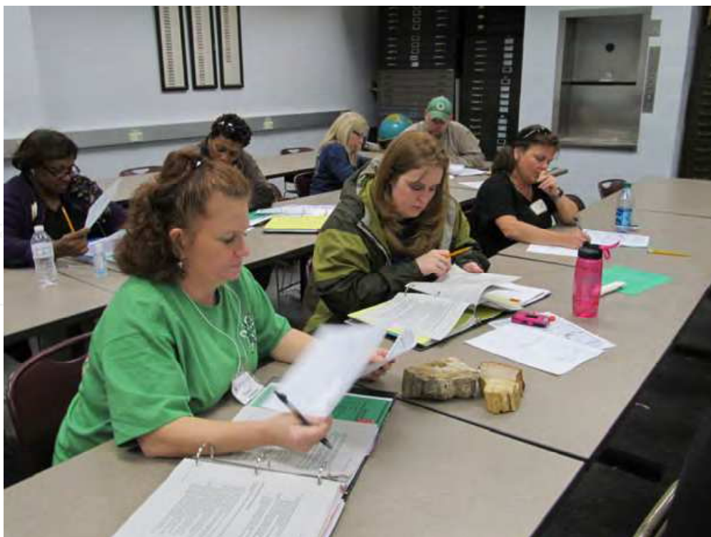
Fig. 7. Teachers in the TANS1 geosciences group compare samples of modern and petrified wood in February 2011.