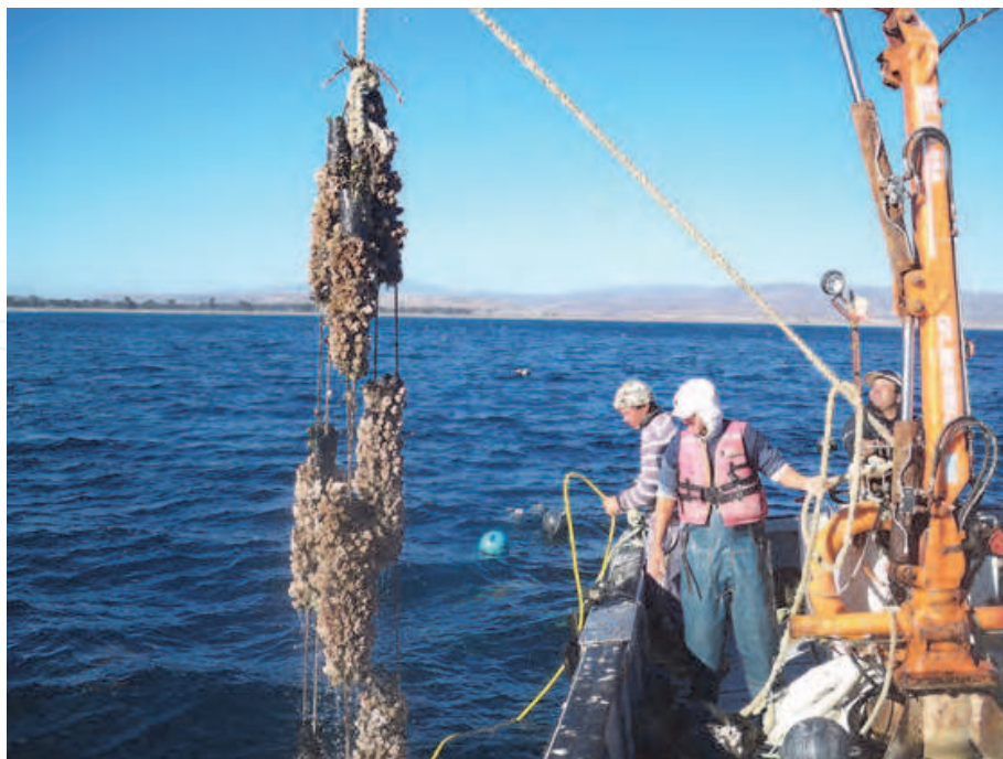
Fig. 4. "Giant barnacle" culture growth system in northern Chile.

Instantaneous growth rates decrease with age, fluctuating from 0.03 cm/day carino-rostral length at the beginning of growth, to 0.0005 cm/day carino-rostral length after 20 months.