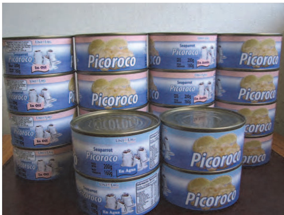
Fig. 5. Canned products of “giant barnacle”.

With regard to markets and prices, the “goose barnacles” can reach prices of between €15-25/Kg on the Iberian market. Of the “acorn barnacle” species, the “giant barnacle” is commercialized on the local Chilean market at prices that range between US$1.5/Kg and 20/Kg. The “mine fujit subo” reaches between US$12-15/Kg on the Japanese market and the “craca”, between €2.5-5/Kg on the local market of the Azores Islands, Portugal (López et al., 2010). Market studies of the “giant barnacle” in Japan indicate that some products can reach up to US$25/Kg. “Giant barnacle” cultures on the Chilean coast have generated an interest in its commercialization in the USA and on the Iberian market.