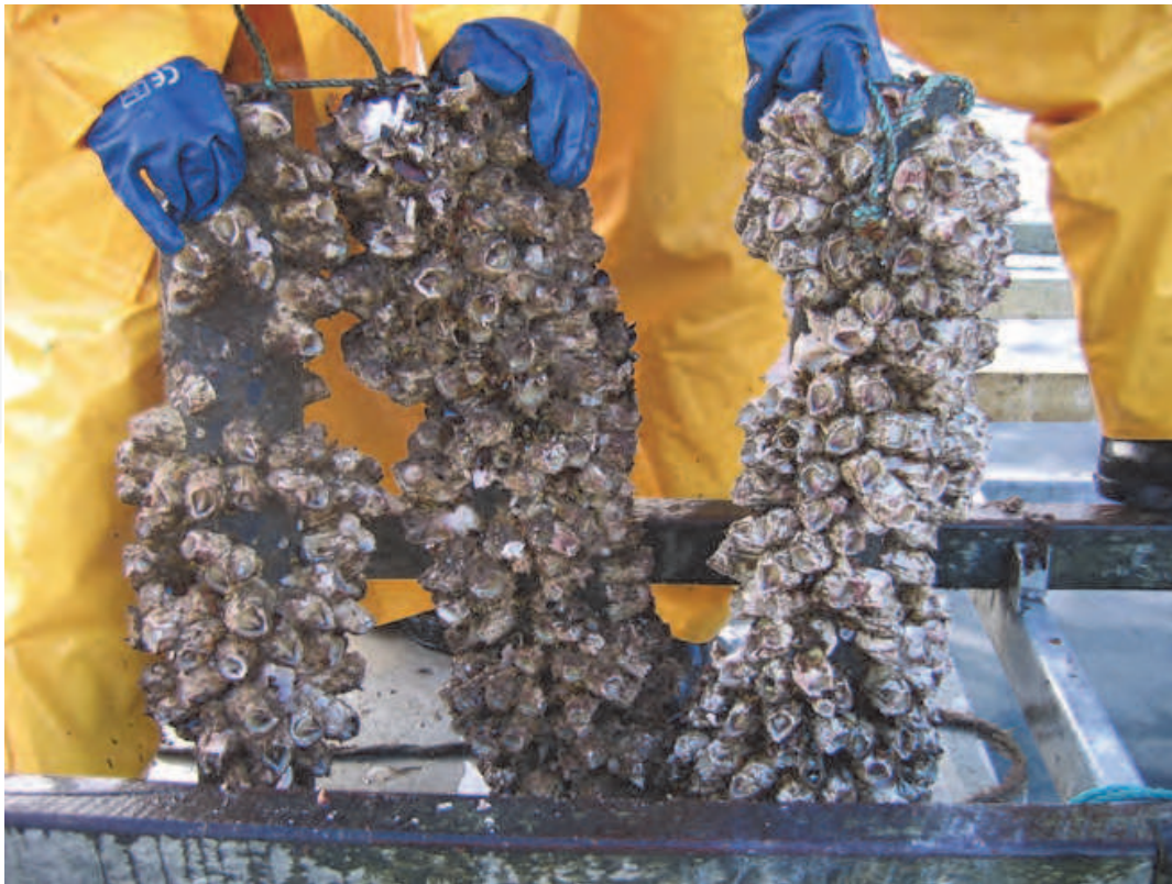
Fig. 3. “Giant barnacle”, Austromegabalanus psittaccus , spat collection from the wild, southern, Chile.

during late spring/early summer (Pham et al., 2011). Recent experiments showed that the choice of materials and their orientation are important factors to be considered for optimizing recruitment values and future spat collector designs (Pham et al., unpublished data). Densities on material placed horizontally, whatever its category, are higher than when material is placed vertically. This difference is particularly pronounced for the most efficient material tested, PVC plates. PVC plates should be considered for the design of spat collection structures.