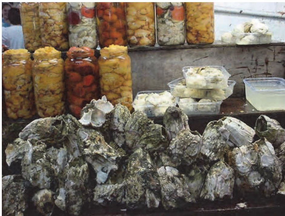
Fig. 2. "Giant barnacle" in a local market in Puerto Montt city, southern Chile.

juveniles in artificial floating substrates (Goldberg, 1984). Results have been scarce, mainly because, in this species, larval settlement is determined by the presence of conspecific adults (Molares et al., 1994; Cruz et al., 2010). Among balanomorph barnacles, similar experiments have been undertaken on Megabalanus azoricus in the Azores islands, where technologies have been designed for installing collectors in the water column. The results indicate that larval settlement occurs, although it is still not possible to ensure that levels are sufficient for industrial scale cultures (Pham et al., 2008; Pham & Silva, 2010; López et al., 2010). Thus, progress has been made, on an experimental level, with these two species, in the area of spat collection from the wild. The only species where studies have advanced from experimental to semi-industrial cultures, is the "giant barnacle", "picoroco", Austromegabalanus psittacus , on the Chilean coast. In this species, it has been shown that levels of spat collection from the wild will permit the development of commercial cultures. Similarly, the growth rates enable specimens of a commercial size to be obtained over a short period of time (López, 2008; López et al., 2010). Furthermore, low cost production technologies have been developed to obtain spat and to enhance growth. The yield and economic feasibility of various products have also been evaluated (Bedecarratz et al., 2011).