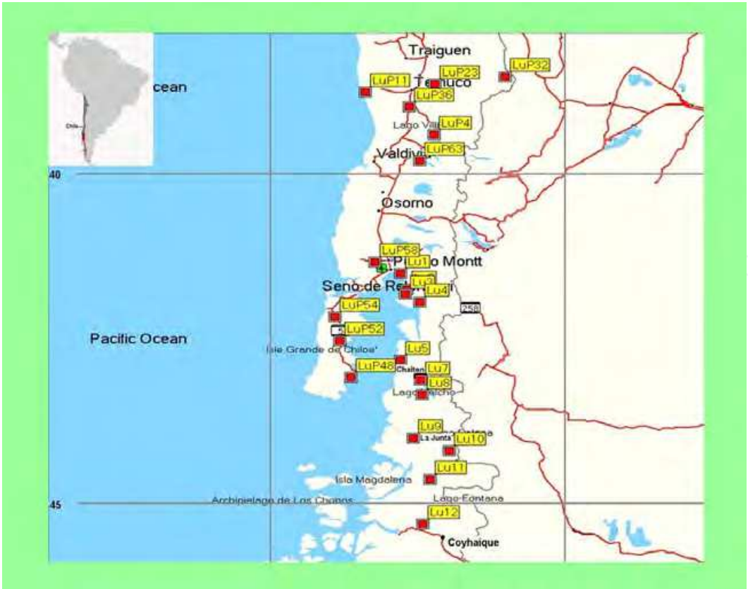
Fig. 3. Geographic distribution of collecting sites for Lotus uliginosus accessions