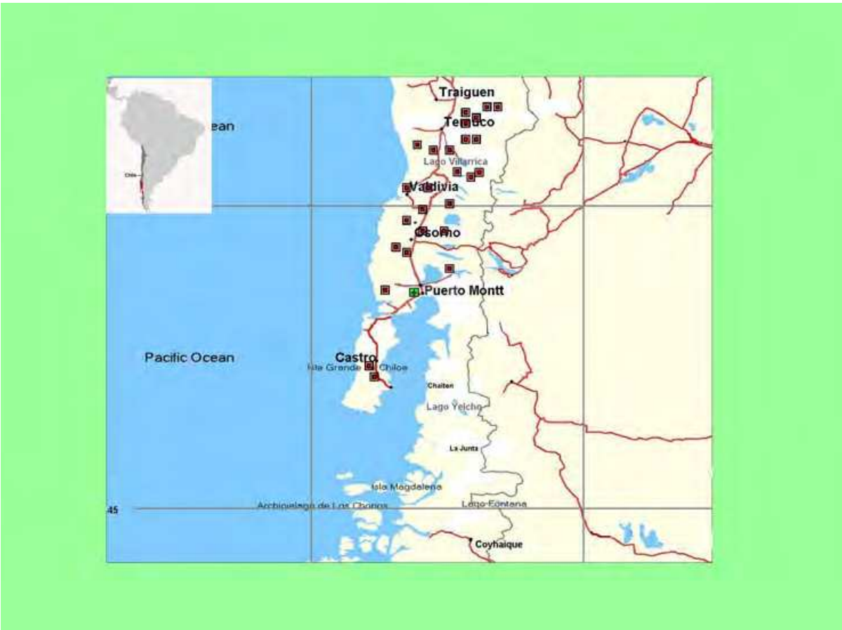
Fig. 1. Geographical distribution of collecting sites for white clover accessions (Ortega et al. , 1994).