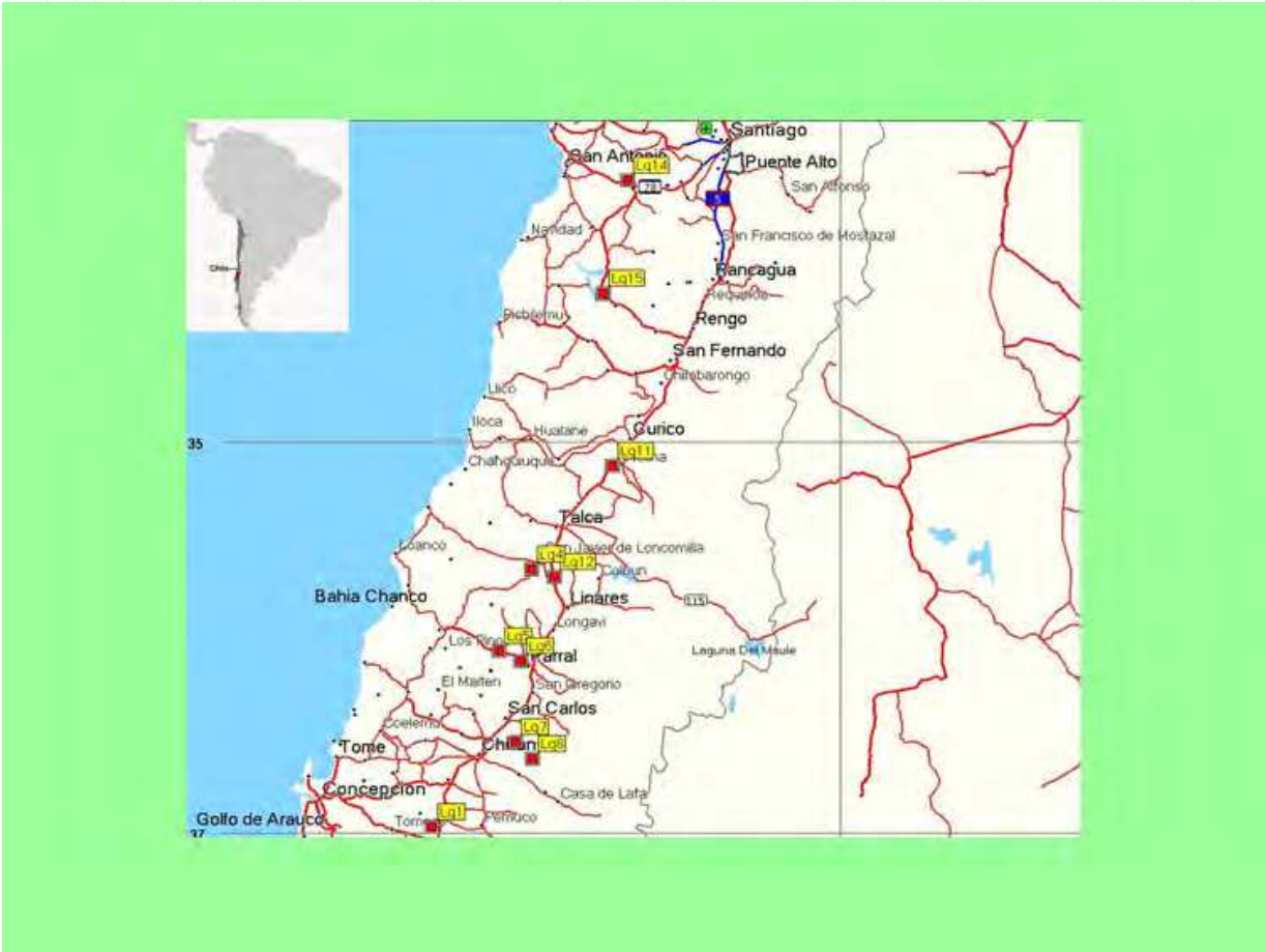
Fig. 2. Geographic distribution of collecting sites for Lotus tenuis accessions

Regions, from 33°S to 38°S (Figure 2). Lotus uliginosus was collected in 1991 in La Araucanía and Los Rios Regions (10 accessions), and in 1999 in Los Lagos and Aysén Regions (11 accessions), from 38°S to 45°S, covering a wide range of agroecological conditions (Figure 3). Thirty plants of each accession were taken from each collection site. They were extracted from the soil, transported in polyethylene bags, and provided with an environment that ensured their conservation during transport. A record was kept of the collection sites with georeferenced location data. Similarly, a soil sample (0-15 cm) was taken from each site to conduct a complete chemical analysis (Table 2).