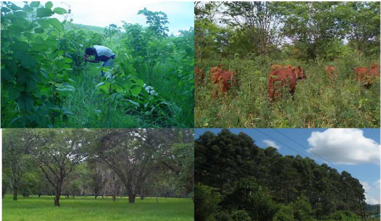
Picture 2. Silvopastoral systems: protein bank ( Cratylia argentea bank, Candelaria farm, University of Antioquia, high density, low density ( Prosopis juliflora trees, Hatiko Natural Reserve), and wind barriers (Colombia coffee area).

Trees used in SPS can be from natural vegetation or planted for timber, industrial products, fodder and fruit or specifically for animal production (providing shadow, fodder, seeds, wood) (Mahecha, 2002). Therefore, there are several types of SPS such as protein and energy banks (cut and carry systems), live fences, wind barriers, and low and high density silvopastures (Picture 2, Mahecha, 2002). The advantages of the high density silvopastures are the best known. The selected type depends on the topography, type of soil, and the presence of strategic areas for water, soil or biodiversity conservation. For that reason, it is important to have in mind the use of the different areas of the farm according to needs: protecting from livestock trampling and grazing the fragile areas or areas that are important to conserve the biodiversity or water, grazing in appropriate areas of pastures with low and high density of trees, and using areas to produce fodder (cutting and carrying) where direct access of cattle is not recommended because they would increase erosion, thus direct grazing should be avoided (Murgueitio and Ibrahim 2001).