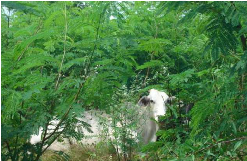
Picture 3. Beef cattle in a SPS of Leucaena leucocephala and grass. Picture from John Jairo Lopera, El Porvenir farm, Cesar, Colombia

without cattle present. These authors demonstrated that animal performance, soil fertility, and tree growth can be positive in a short-term, but could be altered in a long-term because SPS with very high tree density can affect the light availability to grass and the cycling of nutrients. After 140 days of evaluation, T1 gained 0.491 g/animal/d and T2 0.245 g/animal/d and there was no effect of animals on the tree growth, but the fertility of soils was lower in the SPS than in the area without trees ( Table 6 ). These results indicate that the change in soil fertility was not too drastic to affect the tree growth in the short term, but long-term management strategies should consider reducing the tree density to promote nutrient cycling in the system.