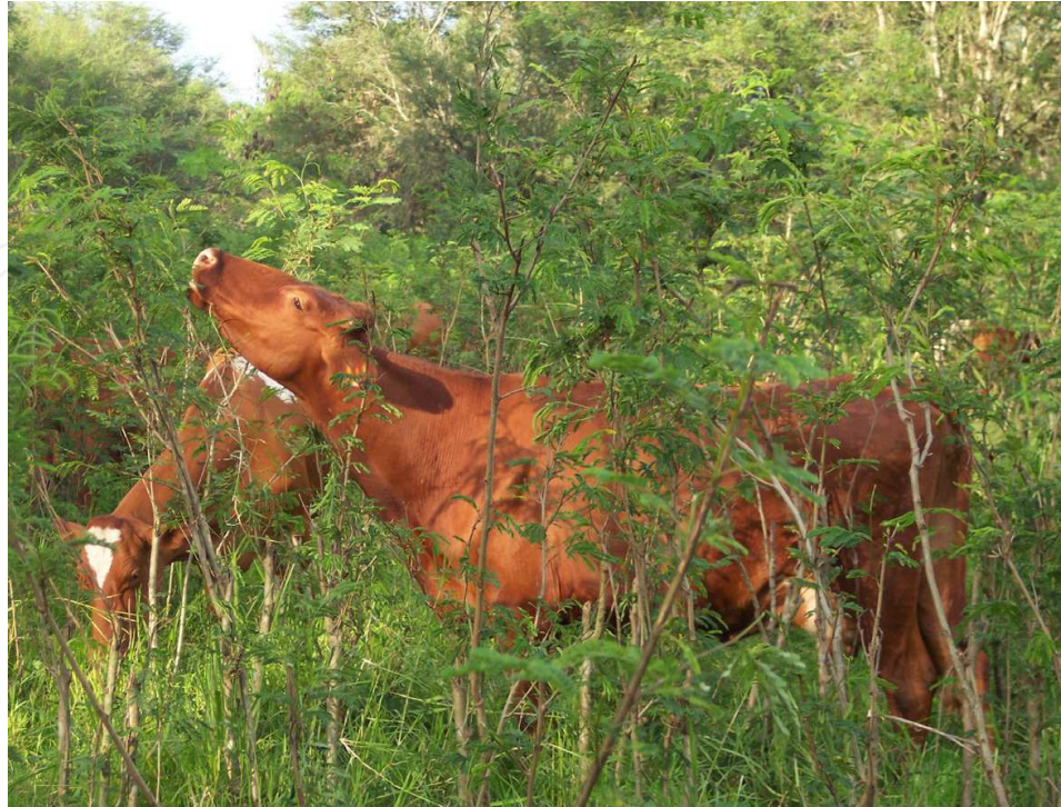
Picture 1. Lucerna cows grazing in a high density silvopastoral system. Picture: Liliana Mahecha, in Hatico Natural Reserve

Colombia exhibits low productivity and competitiveness ( Colombian Ministry of Agriculture and Rural Development, 2005 ) expressed as low number of animals per ha (average 1.2), low birth rate (less than 69%) and low weight daily gain (between 350-450 g/d) ( Mahecha et al. 2002 ). These parameters have shown only modest productivity increments during the last 10 years, with a few exceptions. It is predicted that the situation will worsen in coming years due to the global climate change. According to the IPCC (2007) , the air temperature will increase from 2.4 to 6.4° C with an average of 4.0°C increasing 0.2°C per decade, which is expected to cause a decline in animal performance ( Nardone et al., 2010 ).