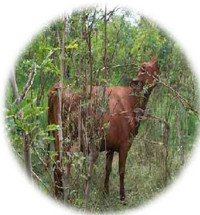
Picture 4. Lucerna dairy cows in a high density SSP. Hatco Natural Reserve, Colombia.