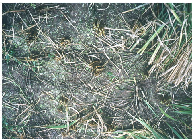
Fig. 4. Straw decay and soil surface conditions after rice harvest