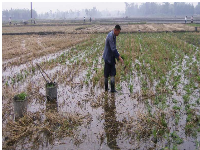
Fig. 2. Broadcasting rice seedlings into high standing-stubble