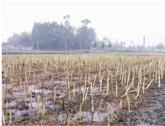
Fig. 1. Field covered with high standing-stubble from the previous rape crop

and give some evidence in the introduction – what type of yields can be achieved with the broadcast-transplanting method in a no-tillage field?