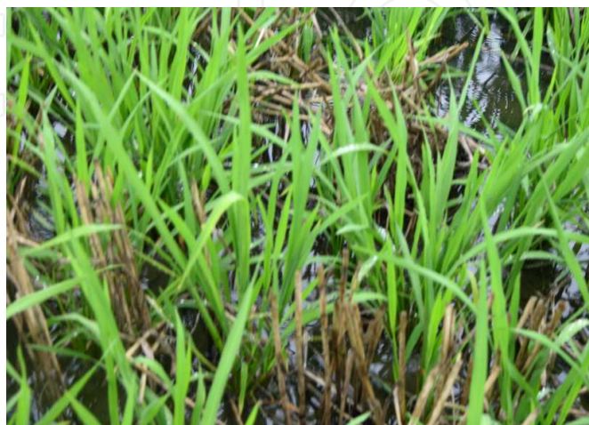
Fig. 3. Early growth stage of rice seedlings