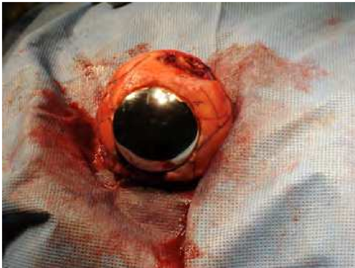
Fig. 2. Partial resurfacing done on a patient with an osteochondral defect

performing a resurfacing arthroplasty. As more bone is preserved in femoral head and the neck preserving the vascularity is a key issue. (McBryde et al. 2008) Therefore some surgeons do not use the traditional posterior approach when performing a hip resurfacing. This is because the posterior approach cuts the medial circumflex femoral artery (MCFA) main artery supplying of the femoral head and neck. This damage is believed to cause AVN of femoral head. Most studies demonstrated a fall in blood supply during posterior approach compared to other surgical approaches.(Beaule, Campbell, and Shim 2006; Bradley, Freeman, and Revell 1987; Howie, Cornish, and Vernon-Roberts 1993) However some authors including us have questioned the clinical significance of this drop as we are not clear whether the drop is transient or permanent and whether it is below the critical ischaemic level to cause the death of osteocytes in the femoral head.(Amarasekera et al. 2008)