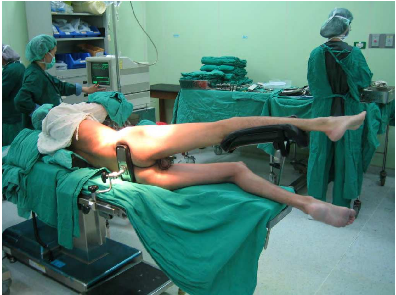
Fig. 4. The special operation table for modified Watson-Jones approach.

Matta et al. has described a unique method of THA using direct anterior approach to the hip. [22] The patient is put on a fracture table that the leg can be pulled by traction in extension and external rotation position. Fluoroscopy can be used during the procedure to control the leg length. However the technique needs a well organized surgical team to adjust the traction and fluoroscopy. Some rare complications such as the ankle fracture or calcaneal fracture have been reported.