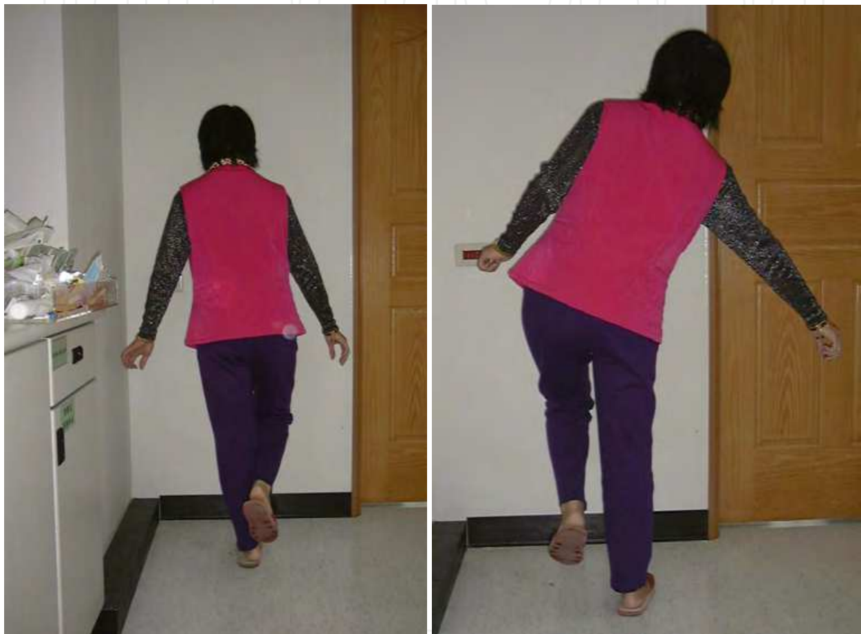
Fig. 2. The patient with abductors weakness. (A) When standing on the sound leg, the pelvis can be kept level and will not drop. (B) When standing on the affected leg, patient will compensatory list to the affected side to avoid pelvis dropping. (Duchenne sign)

and the joint capsule are then incised in a T-manner to facilitate anterior dislocation of the hip. In standard lateral approach of Hardinge [17], part of the vastus muscle can be incised to help the exposure. In modified method, the origins of the vastus muscle can be spared to decrease the tissue trauma. Possible risks of the approach involve an injury to the muscular braches of the superior gluteal nerve or direct injury to the muscle fibers by compression or retraction during surgery. This will result in damage to the gluteal muscles or muscular insufficiency and is associated with higher chance of Trendelenburg sign ( Figure 2 ) postoperatively. [18]