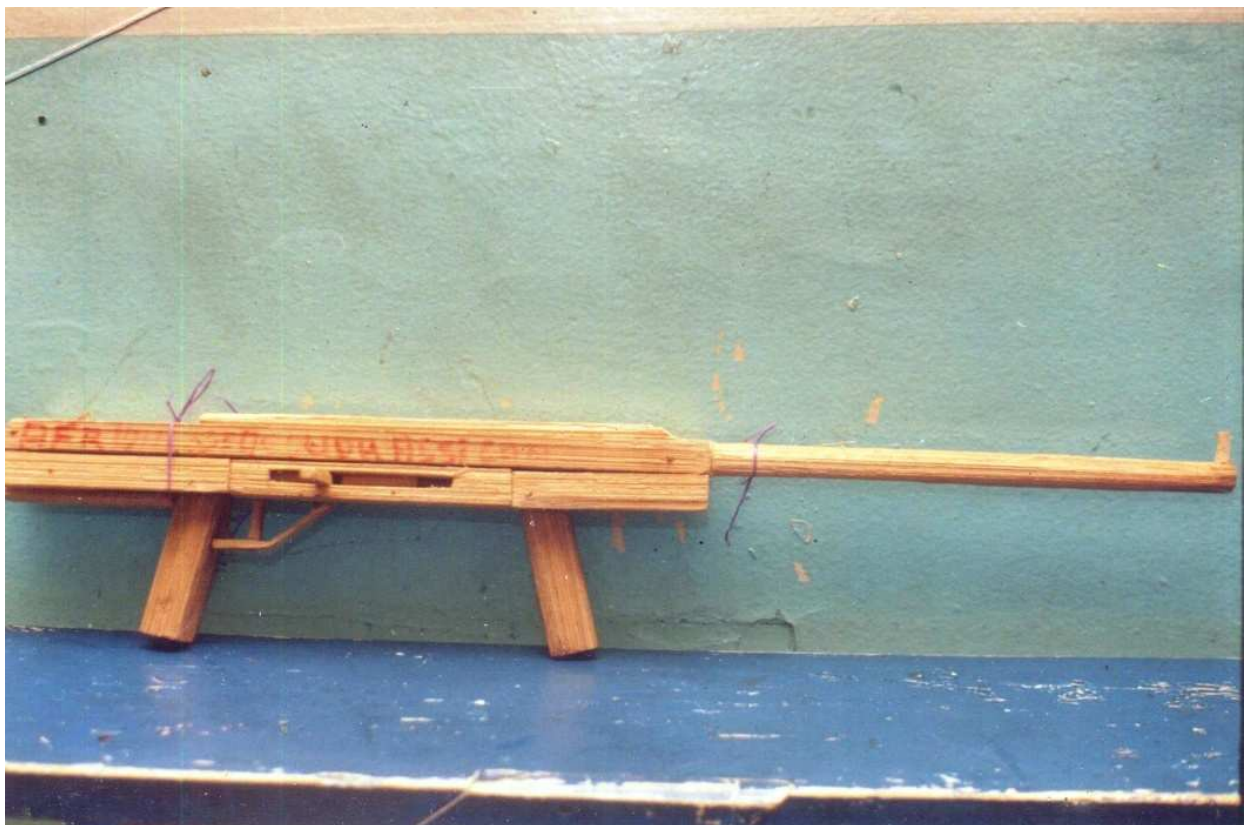
Fig. 3. Bamboo rifle made by a child-Ke-bouébo

memories of war events: the war was still present in their mind and the eventuality of its resumption was not warded off; the children frequently formulated this eventuality. The children's personalities were characterized by narcissistic fragility and failures. They openly expressed their anger, their aggressiveness and their tendency to revolt. One could note, at times, a great pessimism associated with a feeling of a future blocked and a social disinvestment. The children moved about in the village in groups. For example, in August 2006, in the course of the parade of the children of Ké-bouébo , they arrived in battle order chanting war songs wielding tanks, rock launchers, Kalashnikovs, and pistols sculpted in bamboo fiber. An important fact is to be noted: in Pantrokin , the former child soldiers surveyed showed evidence of psychiatric disorders linked to the war. When we asked them about their mental condition, they reported that they had received some form of traditional treatment (plant-made medicine). However the nature of this treatment has not been revealed.