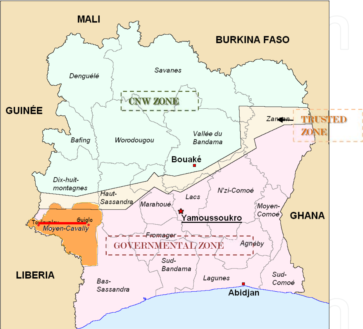
This map shows the division of Cote d'Ivoire after the outbreak of the War of 2002. The country was divided into three zones (government, CNW zone under the control of the rebels and trusted zone). Cote d'Ivoire has been reunited July 30, 2007. The red line materializes the axis Guiglo-Toulepleu.

road), the impossibility to undertake a regular follow-up, and the persistent instability and insecurity in the zone My initial survey carried out during the draft of my specialization in psychiatry dissertation entitled: "The war and the medico-psychology situations of children received at CGI and colliged case in the community" formed the background literature for our intervention in the region.