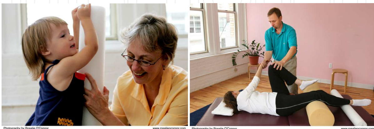
Fig. 1. Examples of Functional Integration lessons.

Functional Integration lessons (see Fig. 1) use manual contact between teacher and student to guide the student to better understand current patterns of behavior and inform the student in a manner that facilitates self-organization of alternative, improved behavior (Feldenkrais, 1972, 1981, 2010). Students are comfortably clothed during lessons that usually last 30-60 minutes. Teachers use supportive, non-invasive touch that can be informative to both students and teachers. Teachers individualize lessons to target functional goals expressed by students, while using principles and techniques common to the Feldenkrais Method . Some of these include: creating a sense of safety with respectful touch and support of body parts; moving limbs through pathways of minimal resistance to suggest more optimal movement trajectories; clarifying existing habitual patterns of positioning and organization to facilitate reorganization; compressing, lengthening, or guiding other movements with emphasis on contact that is as if it were skeleton-to-skeleton; and positioning parts so as to shorten muscles, facilitate decreased contractile activity, and allow more lengthening without stretching (Feldenkrais, 1972, 1981, 2010; Ginsburg, 2010).