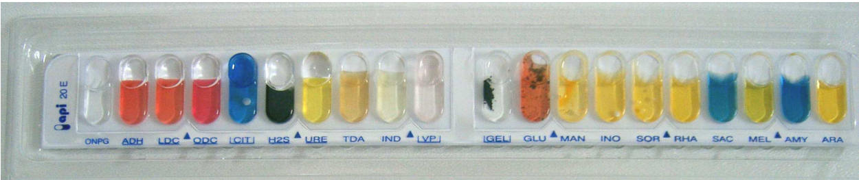
Fig. 1. Typical Salmonella reaction of API 20E test kit.

Samples were analysed according to French Norm for Salmonella spp. NFV 08-052/97. From each sample, 25 g was pre-enriched in 275 ml buffered peptone water (Oxoid, Dardilly Cedex, France) at 37°C for 24h. Afterwards, 0.1 ml of the pre-enrichment sample was incubated in 9.9 ml of buffered Rappaport-Vassiliadis medium (Oxoid, Dardilly Cedex, France) and 2 ml in 20 ml of buffered selenite cystine medium for another 24 h at 42 °C and 37 °C, respectively. The enrichment samples were then applied onto Hecktoen and Kampelmacher agar. Both selective media were incubated during 24 h at 37 °C. Suspicious colonies were identified by Gram staining performed according to the conventional method and also with biochemical test (oxydase reaction). Both Gram-negative and oxidase-negative isolates were further tested. Biochemical tests other than oxidase test were done by using API 20E test kit (bioMérieux, Inc., France). The plastic strips holding twenty mini-test tubes were inoculated with the saline suspensions of the cultures according to manufacturer's directions. This process also rehydrated the desiccated medium in each tube. A few tubes were completely filled (CIT, VP and GEL), and some tubes were overlaid with mineral oil such that anaerobic reactions could be carried out (ADH, LDC, ODC, H2S, URE) (Figure 1).