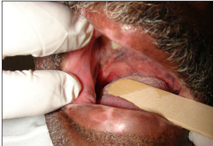
Fig. 2. Erythroplakia in soft palate

results is necessary. Further confirmatory data are needed before any conclusions can be drawn on the possible causal role of HPV in this disease (Syrjänen, 2005).