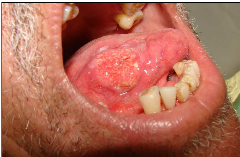
Fig. 4. Oral cancer in tongue.

Sugiyama et al. (2007) examined 66 oral squamous cell carcinomas (OSCCs) for human papillomavirus-16 (HPV-16) infection to evaluate its prognostic significance. Cox regression analysis of 5-year survival demonstrated that patients without nodal metastasis or with intratumoural HPV-16 showed better prognoses compared with each counterpart. In Kaplan-Meier survival analysis, nodal status but not HPV-16 status was statistically significant. The 5-year survival rate of HPV-16 positive patients without nodal metastasis (94%) was extremely high, compared with that of HPV-16 negative patients with nodal metastasis (25%). These results suggest that HPV-16 status as well as nodal status may provide prognostic significance in patients with OSCC.