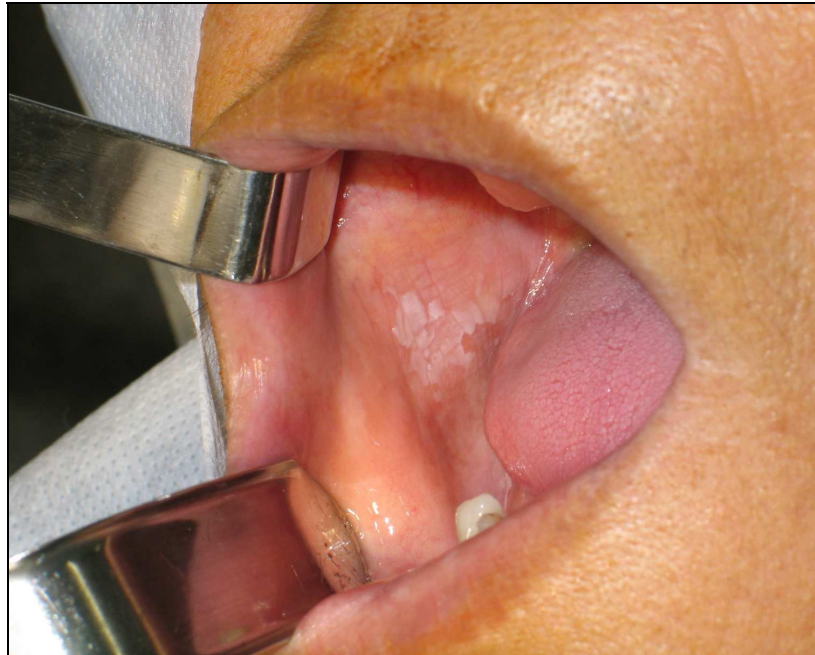
Fig. 3. Leukoplakia in buccal.