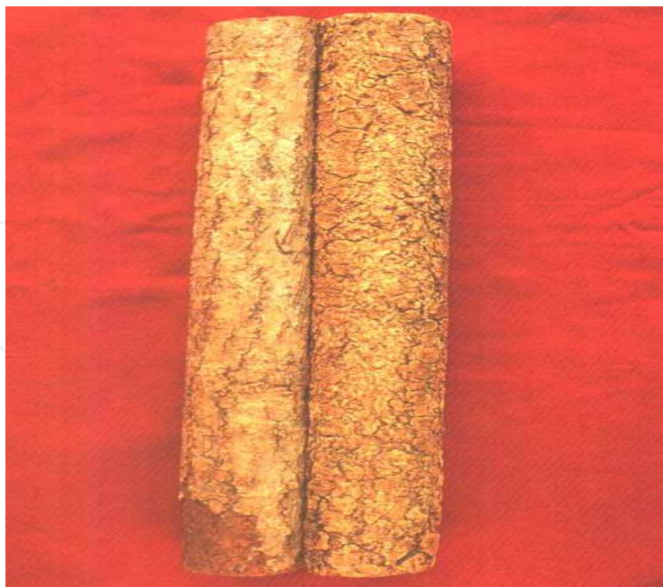
Fig. 2. Medicinal materials of Magnolia officinalis

It is wide used in clinic due to the effect of eliminating dampness and phlegm, promoting qi and removing distention. But the resource of Magnolia officinalis is decreasing and the