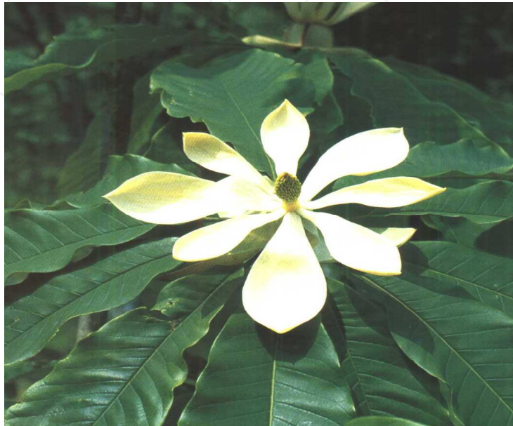
Fig. 1. Medicinal plant of Magnolia officinalis

producing areas mainly include Sichuan, Hubei and Jiangxi province [2]. The characters of its medicinal materials usually showed single or double drum, grey outer surface with vertical wrinkles, purple brown inter surface with wiped oil mark and section with fine crystallization. Microstructure of its medicinal materials usually showed stone and oil cells or starch grains. The modern research also showed that its main effective component is magnolol and honokiol.