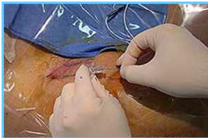
Fig. 2. Catheter placement

When stimulating catheter is being used, the catheter has to be connected to the PNS without changing the current output. The catheter is advanced 5 to 15 cm past the needle tip, and its position is adjusted until quadriceps femoris contractions are still elicited at a current output between 0.4 to 0.5 mA. At this point, the needle is withdrawn and quadriceps contractions are elicited via the catheter again to confirm the final perineural position of the catheter. (Dauri et al., 2007)