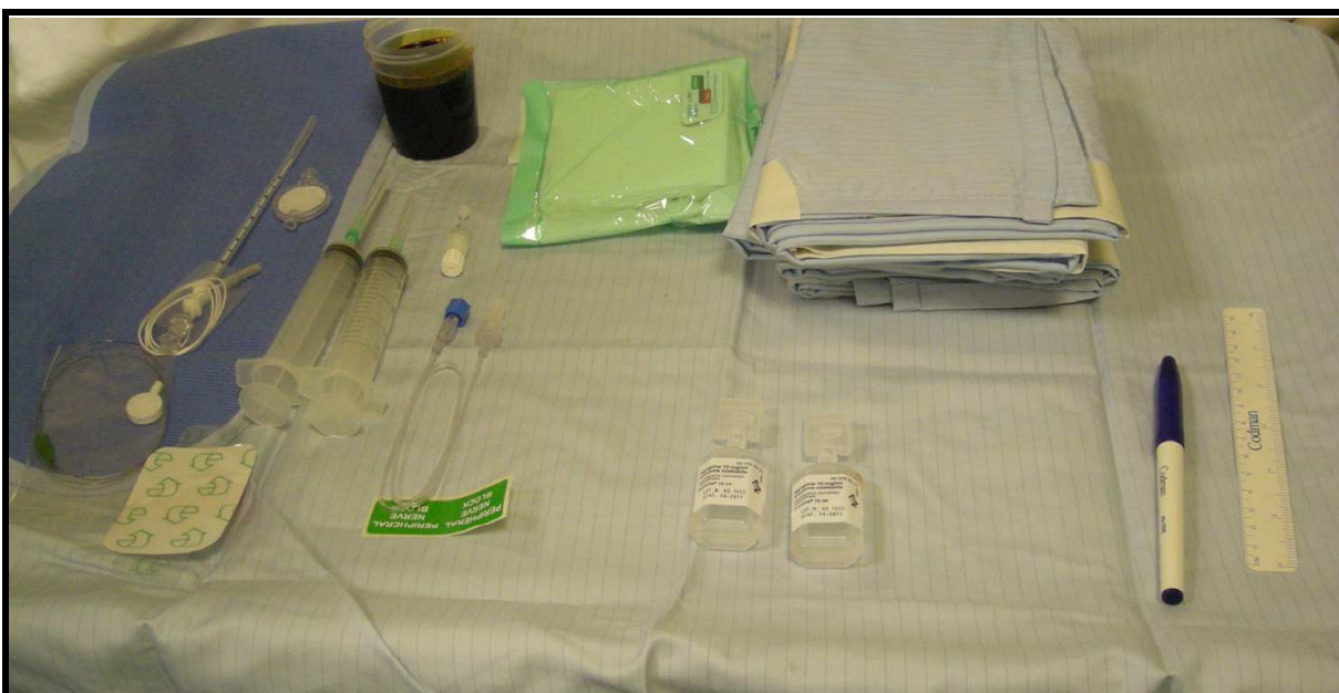
Fig. 1. Equipment

The patient should be in the supine position with legs spread slightly apart. After aseptic skin disinfection and sterile draping of the inguinal region, a local anesthetic is injected superficially. The stimulating needle insertion site is immediately below the inguinal crease, 1 to 2 cm lateral to the femoral artery pulsation. A 50-mm 18-gauge insulated stimulating needle is then connected to the peripheral nerve stimulator (PNS) with an initial current output of 1 mA (2 Hz, 0.1 ms). The stimulating needle has to be inserted with a 45° angle and advanced in a cephalad direction until quadriceps femoris muscle contractions were elicited (as evidenced by cephalad patellar movements). The needle position has to be adjusted until quadriceps femoris contractions are still elicited at a current of 0.5 mA or less. At this point, a 20-gauge catheter is introduced through the needle. The catheter is then advanced for 10 to 15 cm beyond the needle tip, needle is withdrawn and the catheter has to be secured in place. The local anesthetic of choice, has to be injected slowly through the catheter.