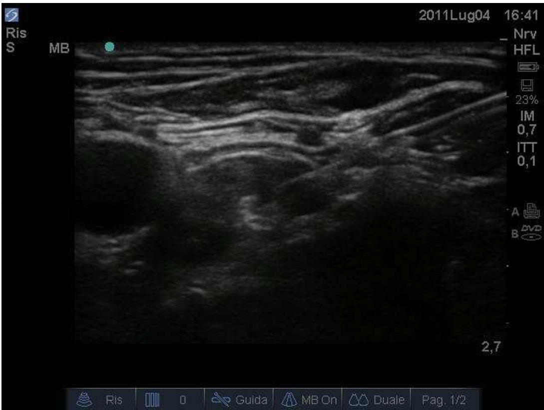
Fig. 4. Ultrasound guided femoral nerve block: needle insertion