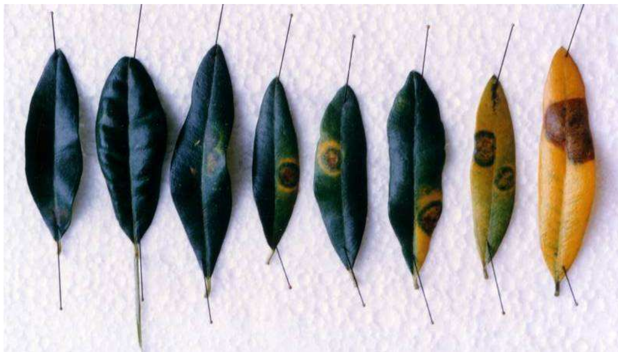
Photo 2. Symptoms of the disease

infection the leaf skin detaches from the epidermis, causing the spots to turn white (Photo 2). In rare cases, the symptoms of the disease also occur on the undersides of leaves, as well as on stems and fruits.