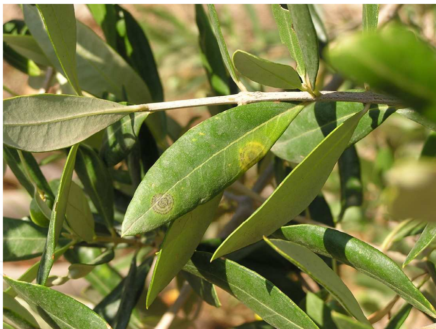
Photo 1. Olive leaf spot

Since the disease most often attacks leaves, it is on them that the symptoms are most conspicuous (Photo 1).