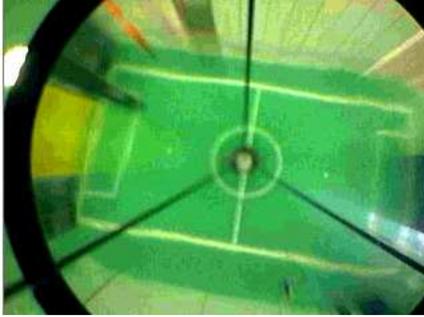
Figure 3. Bird's eye-view of the field obtained by the top catadioptric systems of the robots in Fig. 1

The Hough Transform is applied to the set of transition pixels in a given image, using the polar representation of a line (Gonzalez, R., & Woods, R., 1992):