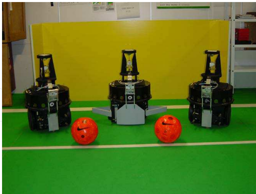
Figure 1. Three robots of the current SocRob team

Distributed World Modeling: A team composed of multiple robots, possibly heterogeneous concerning on board sensing, can benefit from the availability of a world model, obtained from the observations made by the different team members and its on board sensors. This world model can be richer than if it were obtained by a single robot, due to the coverage of a broader area by a more diversified set of sensors. It can also be distributed through the teammates, e.g., by keeping in a robot information which is only relevant locally and by broadcasting information gathered locally but which is of interest for the team as a whole. The sensor fusion problem is similar to the single-robot case, with the important difference that the sensor subsets are now independently mobile and can be actively positioned to improve the determination of object characteristics.