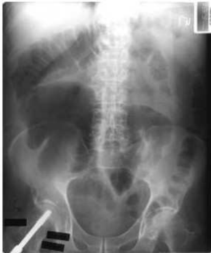
Fig. 3. Distension of the right colon post femoral fracture