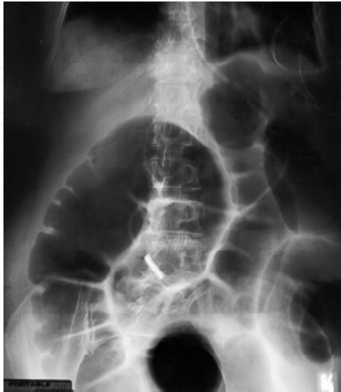
Fig. 2. Transverse colon distension in pseudo-obstruction

passage of gas into distal colon. This facilitates the gaseous filling of the rectum when the patient is positioned for a prone lateral view of the pelvis. He found 75% success rate in excluding mechanical obstruction when there was gaseous filling of rectum.