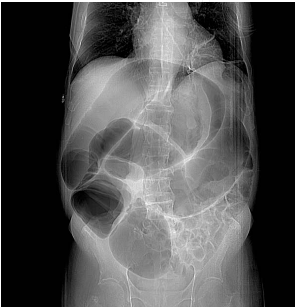
Fig. 1. Distension of colon in pseudo-obstruction

patients present with dimensions greater than this without sequelae [45] . Colonic haustral and mucosal patterns are often maintained on X-rays. Transition from proximal dilated to decompressed colon is usually seen at the splenic flexure. Distension of colon follows Laplace's law which states that pressure required to stretch the walls of hollow viscus varies inversely with its radius [46] . Laplace's law is T=P*R/2 where T is wall tension, P is transmural pressure and R is radius of bowel. Cecum is more vulnerable to distension and perforation as it is the widest part of the colon. Serial plain abdominal x-rays are useful in cases of chronic pseudo-obstruction as they are less likely to perforate than acute obstruction. Serial x-rays are needed to monitor the progress of conservative therapy and to guide further management.