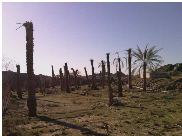
Plate 2. Date palm field neglected due to the salinity.

The aim of this paper is to pool the various aspects of responses of date palm to salinity tolerance and to review the existing knowledge in relation to biodiversity useful to researchers and developmental agencies, engaged in date palm. The review also facilitates interdisciplinary studies to assess the ecological significance of salt stress in relation to date palm cultivation.