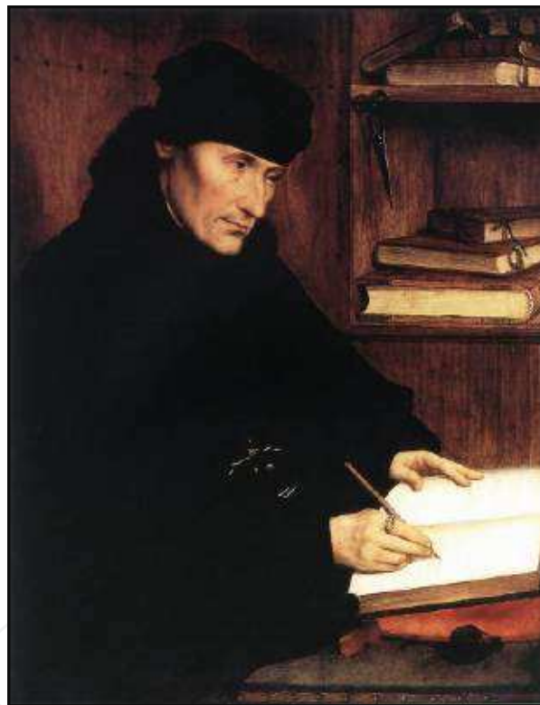
Fig. 1. Quinten Metsys, Portrait of Erasmus of Rotterdam, 1517. Oil on panel, 59 x 46.5 cm.

Analysis of the hands in the Flemish paintings and works attributed to Peter Paul Rubens seems to show hand lesions resembling those of rheumatoid arthritis. To illustrate this, on the reproduction here, swelling of three metacarpophalangeal joints are clearly visible on the right hand of Erasmus of Rotterdam painted by the Flemish Quinten Metsys in 1529, (FIG.1). Desiderius Erasmus (1467-1536), the Dutch renaissance scholar is often quoted for his famous aphorism "prevention is better than cure" and is recognised as the Prince of Humanists for his progressive writings of the time. This painting is testimony to the high cultural climate of the time, and evidence of the links between two great humanist thinkers, Erasmus of Rotterdam and Sir Thomas More, both of whom contributed to the publication of Utopia.