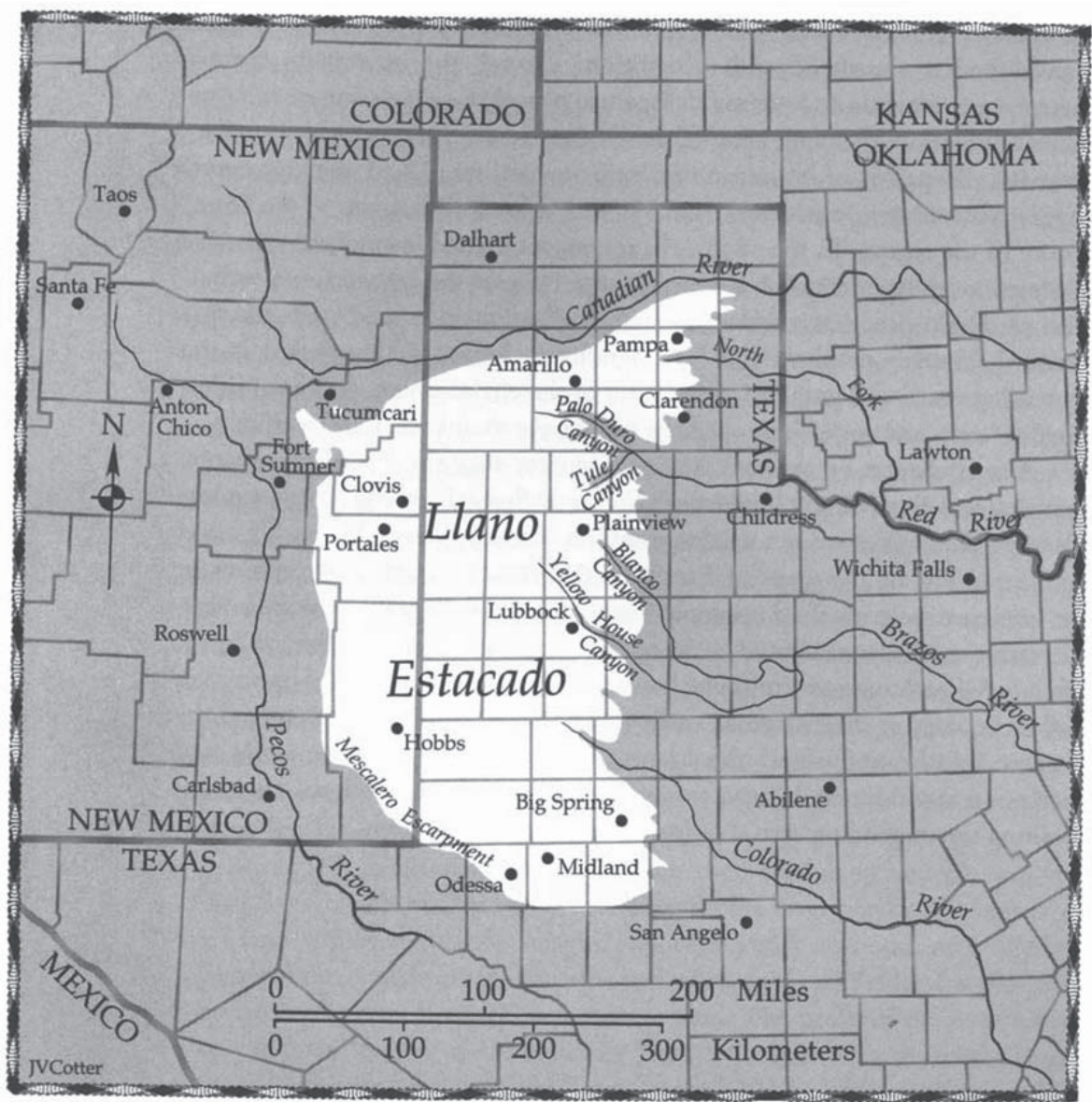
Fig. 1. The Southern High Plains of northwest Texas and eastern New Mexico (from Morris, 1997).

The featureless landscape of the Southern High Plains is relieved only by Holocene dune fields (formed during droughts of the Altithermal period) along its southwestern borders (Holliday, 1989), >20,000 ephemeral playa wetlands scattered across the landscape (Bolen et al., 1989; Haukos & Smith, 1994; Smith, 2003), approximately 40 historically spring-fed saline lakes, and several currently dry, but historically spring-fed tributaries (i.e., “draws”) of the Colorado, Brazos, and Red Rivers (Holliday, 1990). The deep sandy soils associated with the dune fields, found primarily in the southwest portion of the Southern High Plains, along the Texas - New Mexico border, form a unique and distinctive ecosystem about which little is known ecologically.