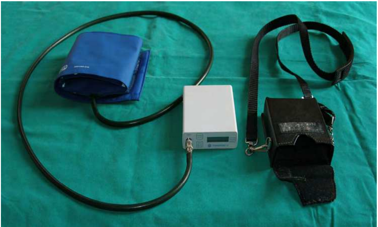
Fig. 2. CardioSoft – Tonoport – V – General Electric, USA device used for 24-hours ABPM

Figure 3 shows audiogram with bilateral symmetric perceptive acoustic disorder. Then we performed internal examination and indicated a 24-hour ambulatory blood pressure monitoring (ABPM). We used for this examination CardioSoft-Tonoport V-General Electric, USA device, which uses oscillometric method of measurement of blood pressure. None of the group member has previous known diagnosis of arterial hypertension, or use of any medication altering blood pressure level. As some medications can evoke or strengthen tinnitus thoroughly, history of patient's medication is very important (Holcát, 2007).