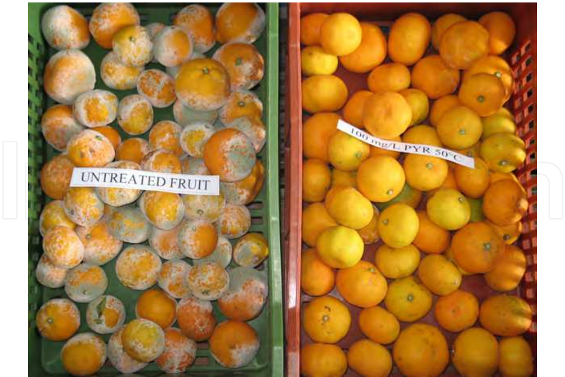
Fig. 3. Stored mandarins treatment with pyrimethanil at 100 mg ·L -1 and 50 °C against P. italicum (D’Aquino et al., 2006; courtesy of Dr. Mario Schirra).