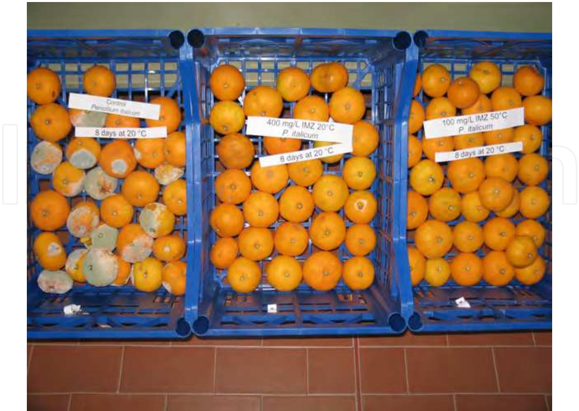
Fig. 2. Stored mandarins treated with Imazalil at 100 mg ·L -1 and 50 °C and 400 mg ·L -1 at 20 °C against P. italicum (Schirra et al., 2005b; courtesy of Dr. Mario Schirra).