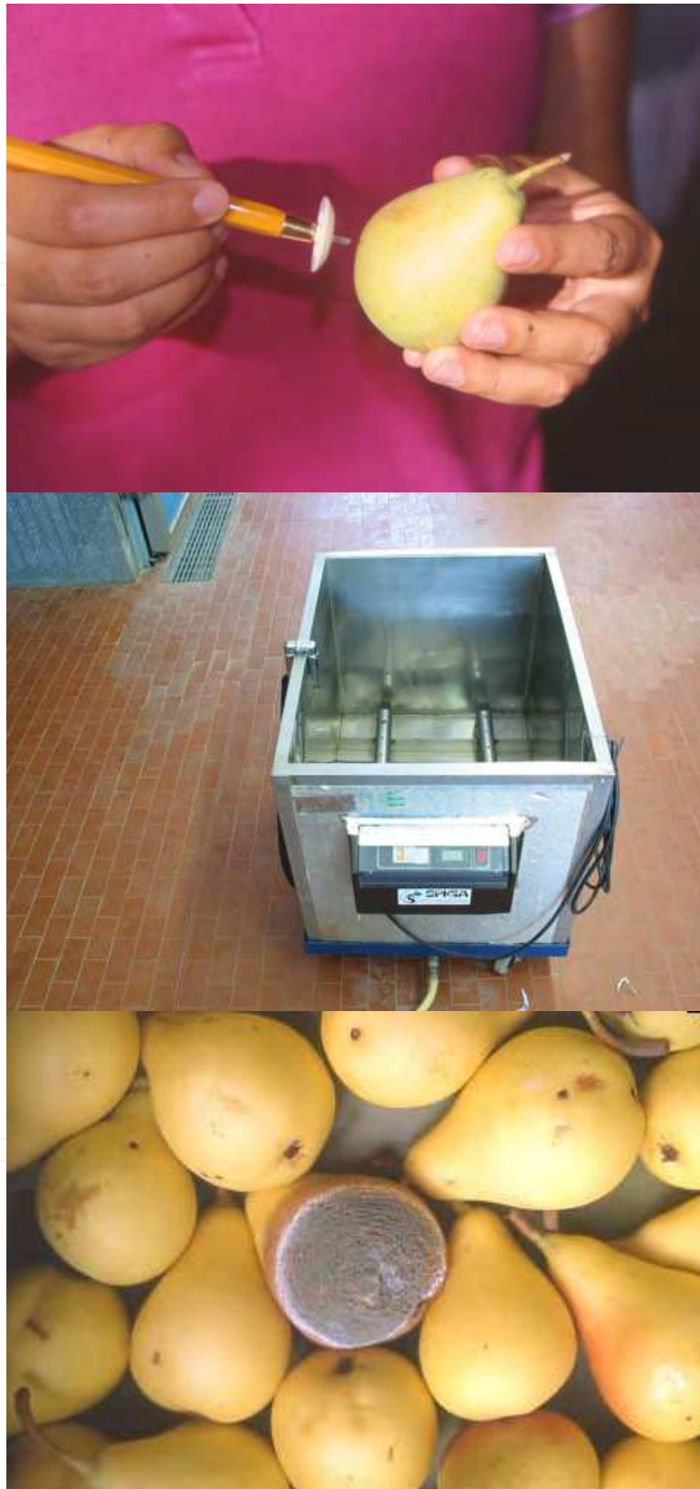
Fig. 4. Wounding of 'Coscia' pears before inoculation with Penicillium expansum (upper), apparatus for water dip at 50 °C (middle), and mould development after shelf life (above) (Schirra et al., 2008b; pictures of the author).