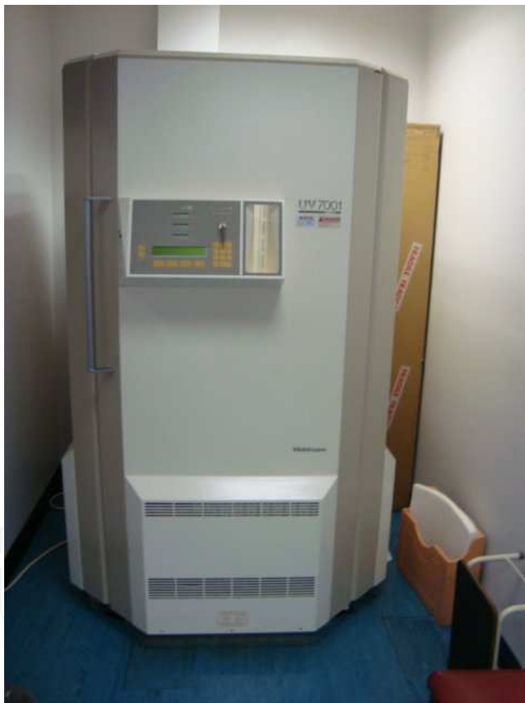
Fig. 1. A Narrowband UVB body box

Ultraviolet B (UVB) phototherapy is one of the most common vitiligo treatments used in the world today, and has evolved from the use of broadband ultraviolet B (BB-UVB) lamps to narrow-band ultraviolet B (NB-UVB) machines (Figure 1) with an emission spectrum of 310-315 nm (e.g. Philips TL-01). Vitiligo was the second most frequently treated disease by NB-UVB reported in a review published from a major U.S. phototherapy referral centre.