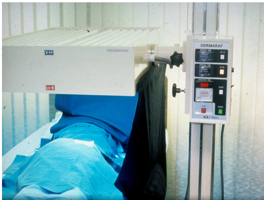
Fig. 2. A targeted UVA light source for PUVA therapy

solution or have the solution directly applied to affected areas. Psoralens may not be used in pregnancy and there is a higher risk of burns, cutaneous malignancy and eye injury.