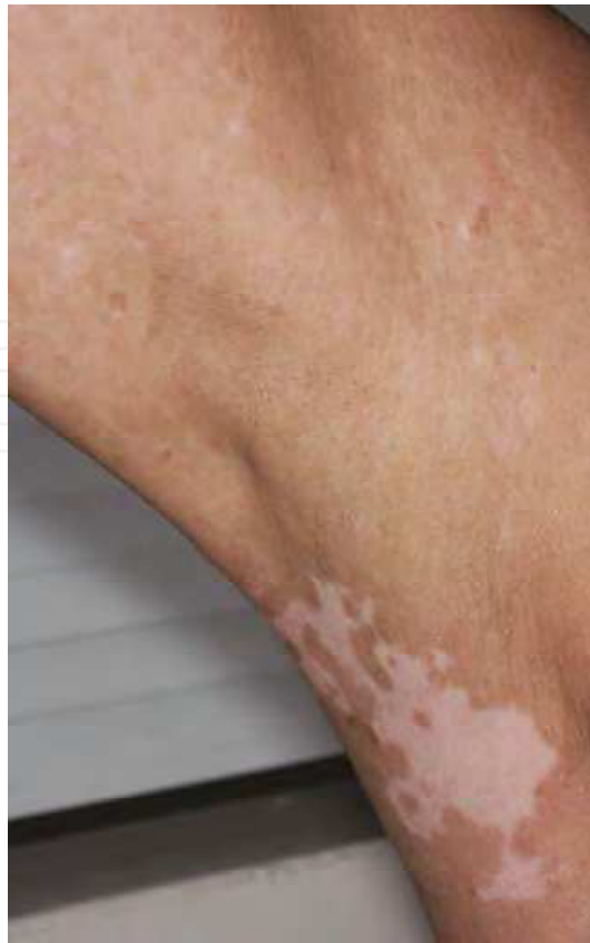
Fig. 5. Amelanotic patches of vitiligo in flexural areas undergoing involution NB-UVB therapy.