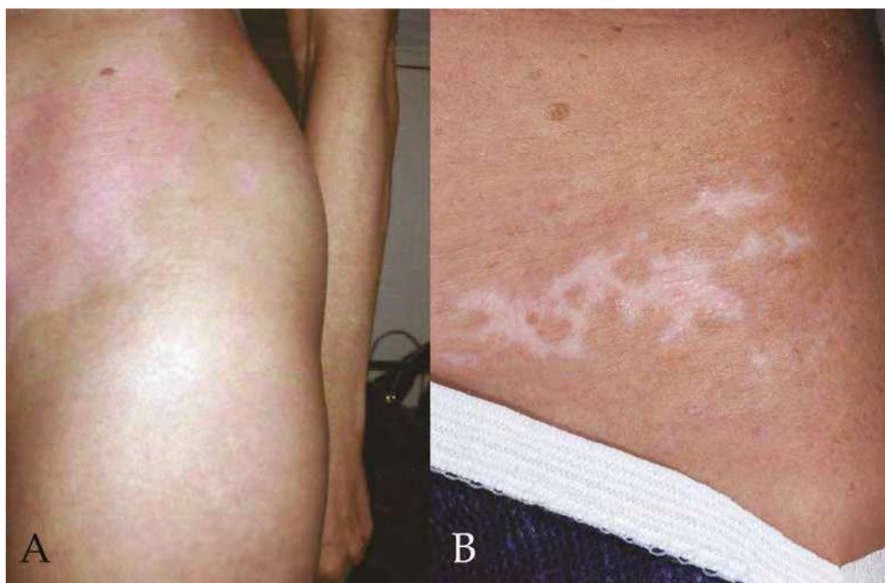
Fig. 4. A. Extensive vitiligo of the lower abdomen and hips. B. Repigmentation of vitiligo patches after 24 months of NB-UVB treatment.

Home UVB therapy may be a valuable and convenient option for select patients. Patient-reported outcomes for home NB-UVB therapy and outpatient NB-UVB therapy revealed that they show similar clinical efficacy and safety profiles (Wind, Kroon et al., 2010). Home NB-UVB is convenient and can be cost-effective in certain situations. However, more reliable long-term follow-up data is needed to further justify home UVB therapy.