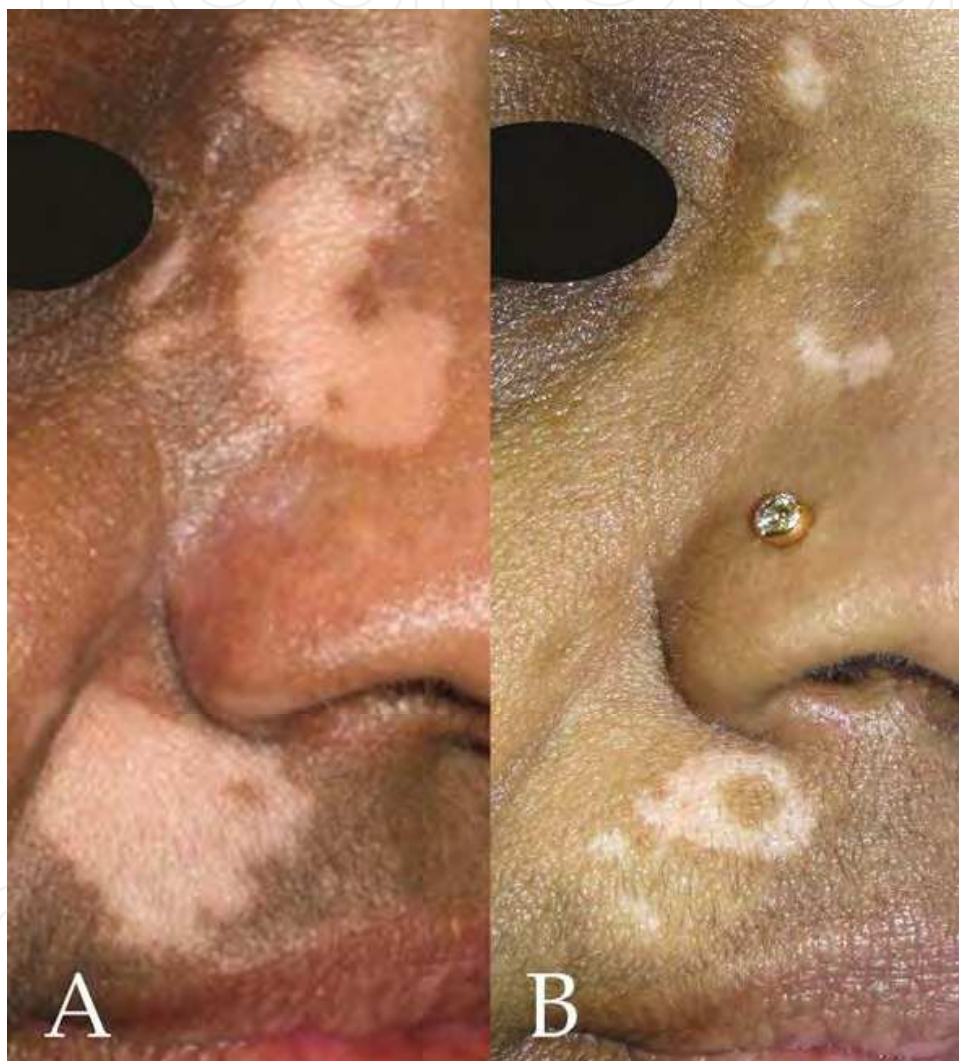
Fig. 3. A patient with facial vitiligo was treated with NB-UVB phototherapy three times weekly. A. The patient prior to initiating treatment. The patient was then started at 200 mJ based on standard protocol for Fitzpatrick skin type III. B. The patient with notable repigmentation after treatment 56 at a dose of 1001 mJ.

NB-UVB for vitiligo is most effective on the face and neck, followed by the trunk, and then upper extremities (Figure 3). Acral regions including the lower extremities, palms, and soles are more resistant to treatment. The reason has yet to be elucidated, but the regional density of hair follicles, which are reservoirs for melanocytes, are thought to play a role (Stinco, Piccirillo et al., 2009). In general, the repigmentation patterns in patients treated with NB-UVB are, in descending order, perifollicular (51.3%), then marginal, diffuse, and combined (Yang, Cho et al., 2010). However, the marginal pattern was observed to be the most common when >75% repigmentation occurred by 12 weeks of treatment (Yang, Cho et al., 2010).