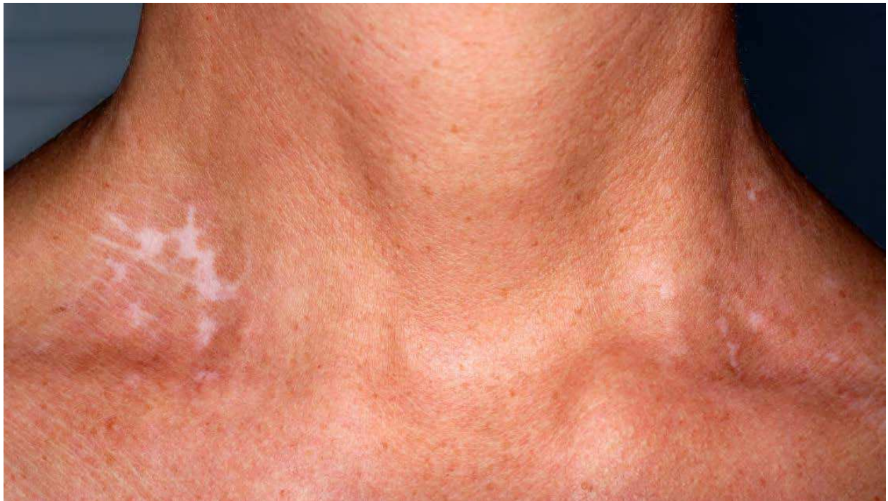
Fig. 2. Near complete repigmentation of vitiligo patches with NB-UVB treatment.