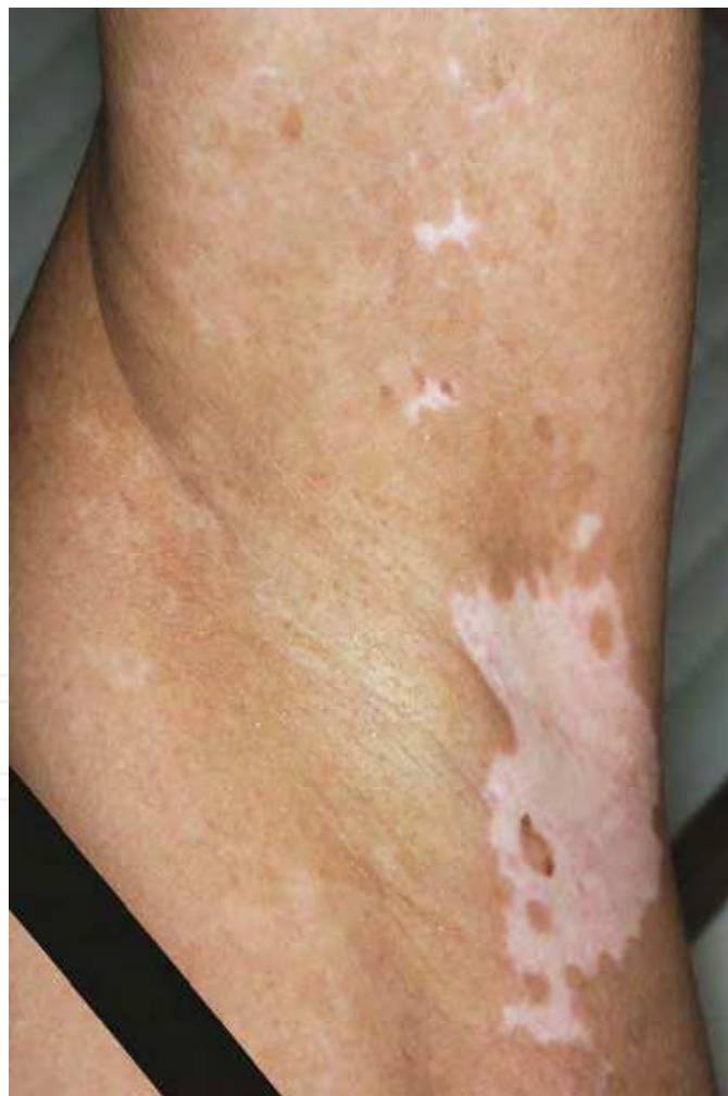
Fig. 6. NB-UVB is an effective treatment modality for vitiligo. Short term adverse effects are primarily related to phototoxicity. Long-term carcinogenic risk may not differ greatly from the general population.

When comparing UVB and PUVA carcinogenic risk, a single PUVA increases risk 7 times more than a single UVB treatment (Lim and Stern, 2005). Even with a history of PUVA therapy, patients who had less than 300 treatments of UVB had no appreciable increase in NMSC risk (Lim and Stern, 2005). Available data on NB-UVB therapy has not consistently identified a significant increase in NMSC when compared to the general population (Table 4). The majority of follow-up data was primarily taken from Caucasian populations, but the same conclusion has been drawn in non-Caucasians with skin types III-V (Jo, Kwon et al., 2010). An increased risk of BCC was noted in two Scottish studies, one with NB-UVB monotherapy, and the other with a history of both NB-UVB and PUVA usage (Stern and Laird, 1994; Man, Crombie et al., 2005). However, the temporal relationship between tumor diagnosis and phototherapy makes a relationship between therapy and cancer unlikely in either study (Stern and Laird, 1994; Man, Crombie et al., 2005). In addition, it is common to use topical pimecrolimus and/or tacrolimus as adjuncts to NB-UVB. Topical pimecrolimus and tacrolimus have not been found to increase risk of NMSC in adults. Therefore, even in combination with NB-UVB, there should be no cumulative carcinogenic effect. Therefore, UVB, in particular NB-UVB, may be the phototherapy option with the least carcinogenic risk in all skin types.