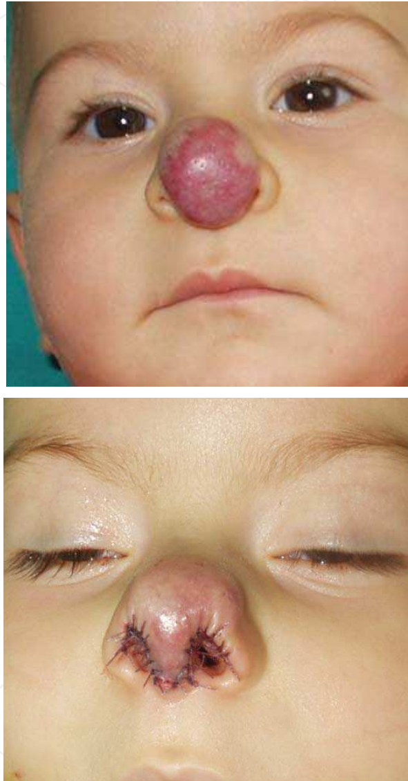
Fig. 3. Intraoperative result after excision of nasal hemangioma with open rhinoplasty approach

under general anesthesia, with local infiltration of 1:100,000 adrenalin at the incision place. The selection of the optimal surgical approach should be made carefully on the basis of the affected regions. An open rhinoplasty approach, with or without skin resection, should be preferred technique for the lesion that involved nasal tip, columella and alar subunits, and in if wider approach is needed the nasal subunits had to be respected (Fig.3).