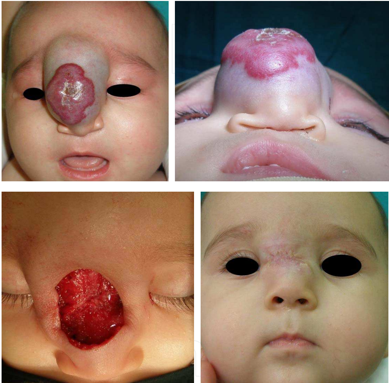
Fig. 4. Circular excision and „purse string suture” technique for large nasal hemangioma

Subtotal excision for large hemangioma, without all of the affected skin, which will fade in the involutive phase, avoiding visible scars, by placing the incision along the columellar edge and parallel to the nostril is appropriate approach (Fig.4).