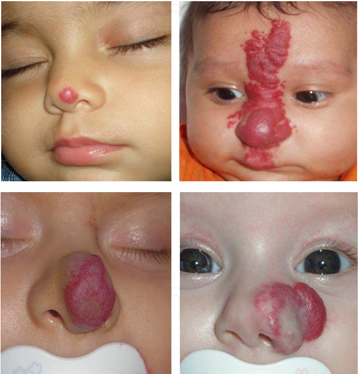
Fig. 1. Different types of nasal hemangioma from small no harming, involving nasal tip, complicated with nasal obstruction and large superficial hemangioma

Nasal hemangiomas are among the more distressing, if large, can cause a significant residual damage to the shape of the nose [6]. Due to their location, nasal hemangiomas are profoundly disturbing lesions both for patients and their families (Fig. 1). Hemangiomas involving the nose occur approximately 15,8% of facial hemangiomas [13]. The nasal tip is by far the most common site of nasal hemangiomas [11].