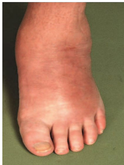
Fig. 1. Red hot swollen foot.

The differential diagnosis of a red, hot swollen foot is: severe infection (osteomyelitis) in case of a concurrent foot ulcer, cellulitis, bone fracture, gout or septic arthritis. Most difficult is to differentiate between an acute CN and osteomyelitis if a foot ulcer is present. Clinical directions in favour for osteomyelitis are a positive probe to the bone test and radiological abnormalities in relation to the ulcer, that is mostly located on pressure points like metatarsal heads or rocker-bottom. Radiological abnormalities in favour of CN are radiological abnormalities in the mid foot. The chronic not active Charcot foot is characterized with joint deformity, and or (sub) luxation of the metatarsals leading to rocker-bottom. These deformities cause elevated plantar pressure leading to abundant callus formation and an increased risk for foot ulcers.