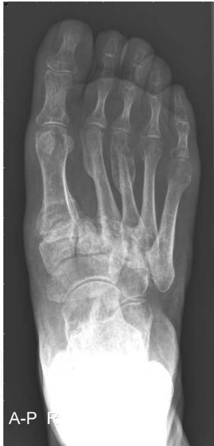
Fig. 2. Dislocation in tarsometatarsal joints: Lisfranc's dislocation

Therefore has a plain X-ray an important role in diagnosis and follow up of CN.