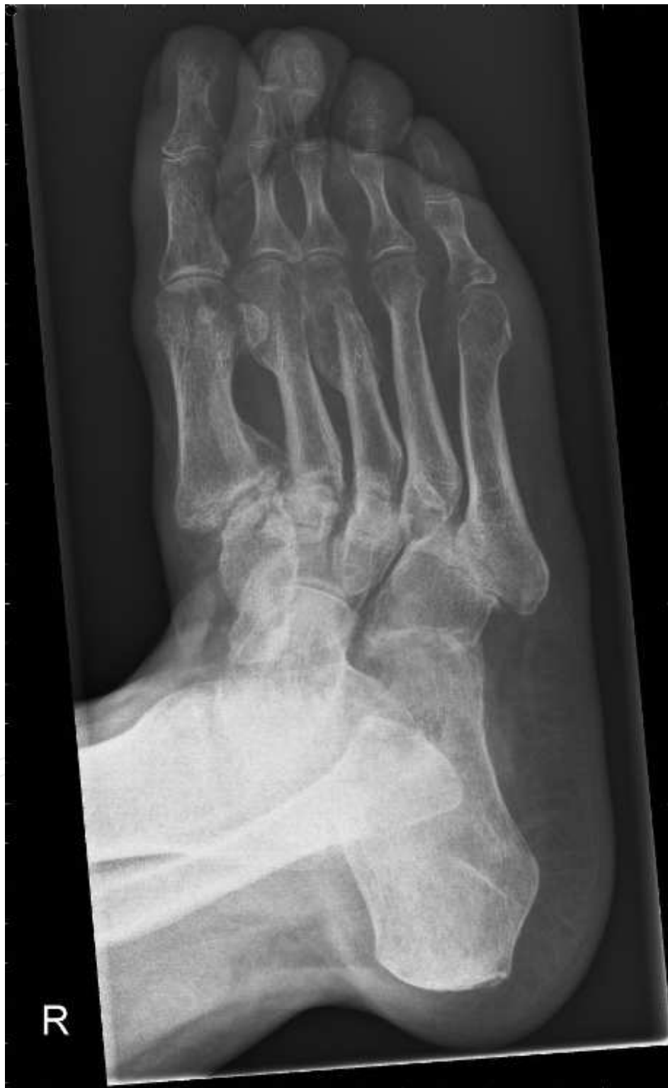
Fig. 3. Dislocation in Lisfranc, talonavicular joint (Chopart) and ankle fork

tomography (CT) is not well investigated. The five D's as mentioned above can be adapted to CT images. Bone scintigraphy (technetium) is the most often used nuclear method. Focal hyperperfusion and or focal bony uptake are seen on the scintigraphy but are not specific for CN. Also in osteomyelitis these characteristics are seen.