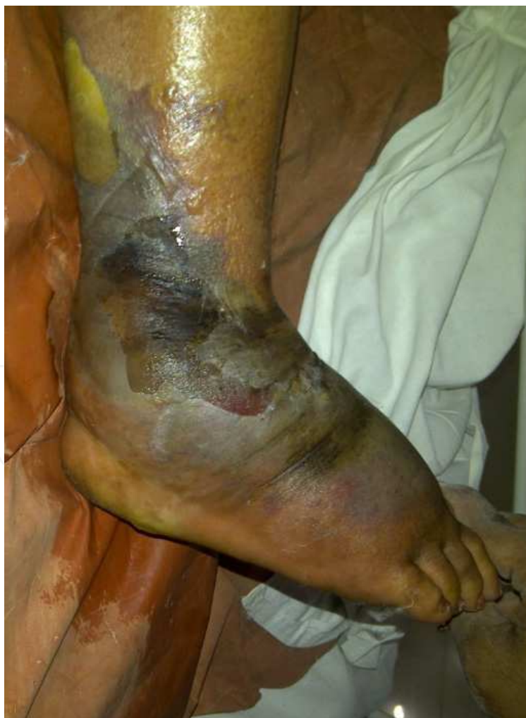
Fig. 1. Severely infected foot

Peripheral vascular disease (PVD) has been reported to be low among Asians (Pendsey 1998) ranging between 3 – 6% as against 25 – 45% in Western world. (Marinelli et al., 1979; Migdalis et al., 1992; Walters et al., 1992). The prevalence of PVD increases with advancing age and is 3.2% below 50 years of age and rises to 55% in those above 80 years of age. Similarly it also increases with increased duration of diabetes, 15% at 10 years and 45% after 40 years (Janka, et al., 1980). In India the number of diabetic patients above the age of 80 years or with the duration of diabetes of more than 30 years is extremely low, thus explaining the low prevalence of PVD in Indian diabetics. (Pendsey 1998).