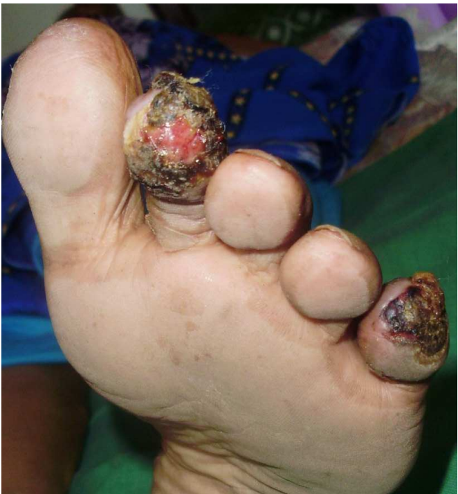
Fig. 3. Showing ulcers on second and fifth toes due to rat bite

Certain atypical presentations are seen because of socio economic and cultural factors prevalent in India. Patients with neuropathy and consequent loss of protective sensations, who sleep on the floor are invariably bitten by house rats who nibble toes creating deep foot ulcerations. Patients notice the ulcers on waking up to find blood stained bed linen, in the morning. Patients notice the ulcers on waking up to find blood stained bed linen, in the morning.