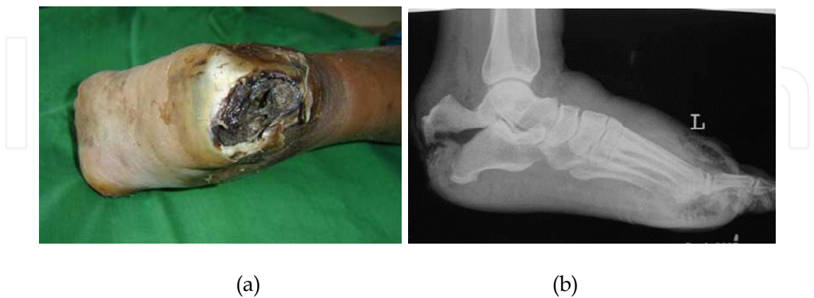
Fig. 2. (a). Infected heel with necrosis of the soft tissue (b). Radiograph showing osteomyelitis of calcaneum, soft tissue swelling with gas shadow in the area of forefoot.

Severely infected foot is the hallmark of Indian diabetic foot. It is not uncommon to see a patient with foul smelling, oedematous and severely infected foot with moribund general condition. Such patients have life threatening infection and therefore invariably require primary limb amputation. (Pendsey 2010).