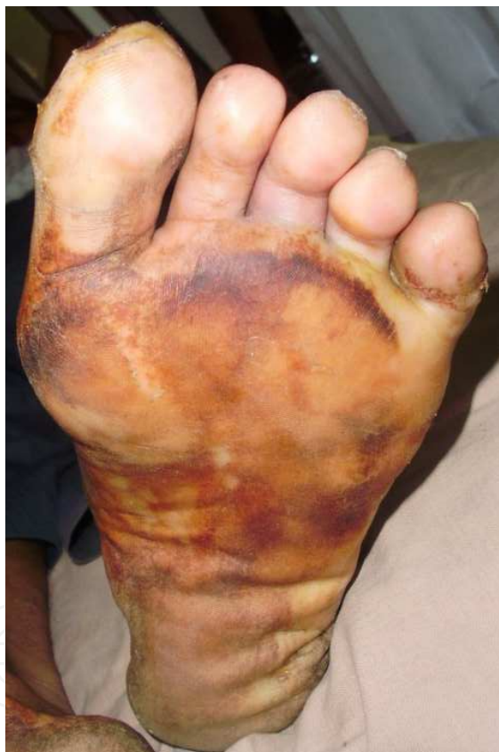
Fig. 4. Showing thermal injury on the plantar area of right foot.

Indians are known for sitting cross legged for long hours at work and during worship. Repeated and prolonged pressure over lateral malleolar areas lead to formation of bursae. Such bursae over lateral malleoli are dark and hypertrophied but are usually harmless in non neuropathic individuals. In diabetics with neuropathy, these bursae get ulcerated and often secondarily infected, creating a surgical emergency. Indian women wear metal (silver being commonest) toe rings in one or more toes of both feet, which is part of tradition. In neuropathic feet with deformities of toes, these toe rings often cause strangulation in presence of swelling of the feet. In tropical climate due to excessive sweating, fungal infection quickly sets-in, in web spaces. In diabetics with neuropathy these macerated ulceration often gets secondarily infected and find their way, quickly, to deep plantar compartments creating a limb threatening situation. (Pendsey 2010).