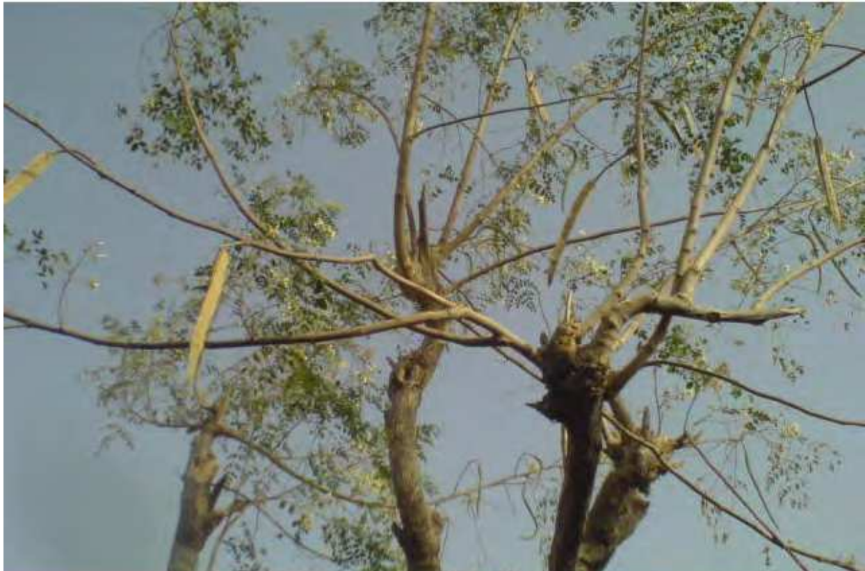
Fig. 2.1. Moringa oleifera tree

The Moringa tree grows mainly in semi-arid tropical and subtropical areas, but grows best in dry sandy soil; it tolerates poor soil, including coastal areas. It is a fast-growing, drought-resistant tree that is native to the southern foothills of the Himalayas, and possibly Africa and the Middle East. The tree has its origin from the Southern Indian State of Tamilnadu. Today, it is widely cultivated in Africa, Central and South America, Sri Lanka, India, Mexico, Malaysia and the Philippines. It grows up to 4m in height and develops to flowering and fruiting within one year of its cultivation. Moringa oleifera is considered as one of the world's most useful trees, this is because almost every part of the tree can be used for food, or has some other beneficial property. Hence it is commonly called the 'Wonder Tree'. In the tropics, it is used as foliage for livestock. The immature green pods, called "drumsticks" are probably the most valued and widely used part of the tree. They are commonly consumed in India, and are generally prepared in a similar fashion to green beans and have a slight asparagus taste (Rajangam et al , 2000).