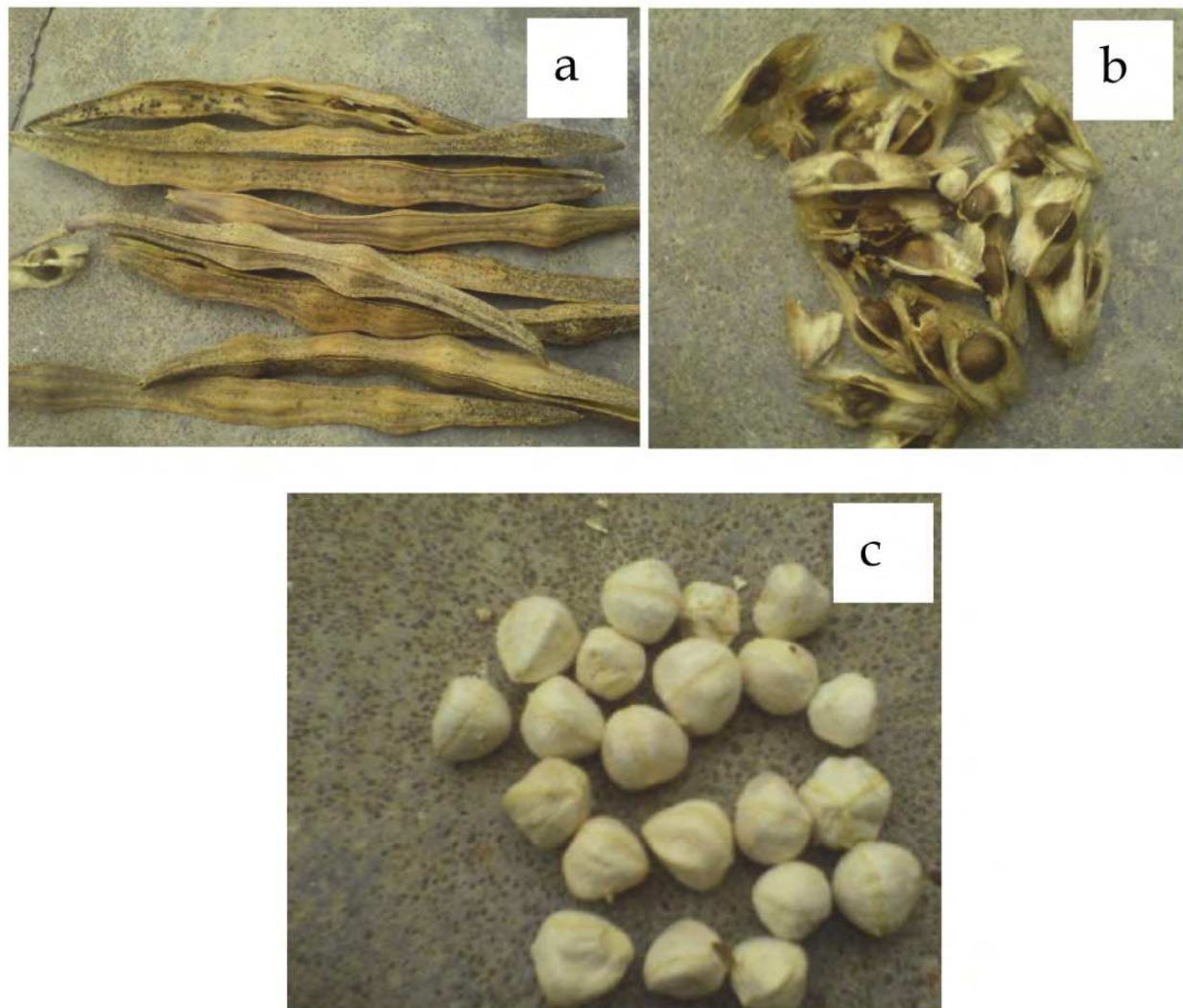
Fig. 2.2. Moringa oleifera (a) Dried pods (b) Seed kernel with husks (c) seed kernel without husk

The refined oil is clear, odourless and resists rancidity like any other botanical oil. The seed cake remaining after the oil extraction can be used as fertilizer or as flocculants to treat turbid water. The leaves are highly nutritious, being a significant source of beta-carotene, Vitamin C, protein, iron and potassium; it is consumed mostly among the Hausas in Northern Nigeria. In addition to being used fresh as a substitute for spinach, the leaves are commonly dried and processed into powder and used in soups and sauces.