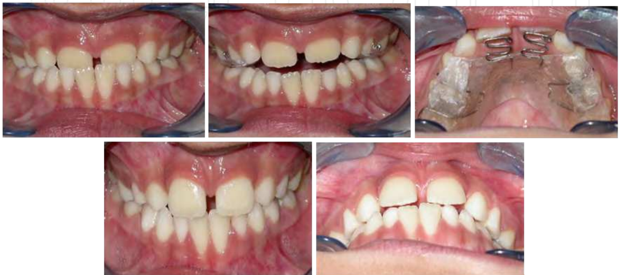
Case 19. Early correction of anterior crossbite with a removable Hawley plate fitted with a simple cantilever spring

Occlusal elevator wedges: these are bonded onto the occlusal surfaces of the deciduous maxillary molars. The height of the composites is adjusted for centred occlusion and set so as to obtain an anterior occlusion of about 1 mm. The tongue, by centrifugal pressure, brings the incisors naturally into the correct position.