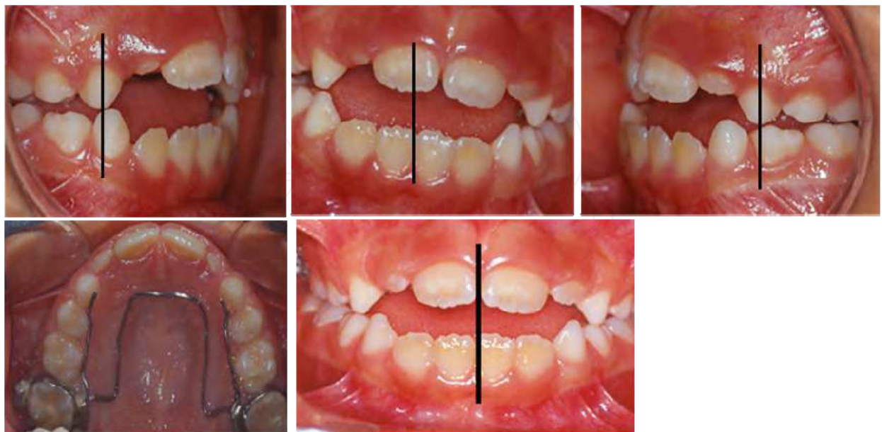
Case 11. Interceptive treatment of a mandibular lateral right deviation following a bilateral maxillary endoalveolitis by maxillary expansion using a quad helix