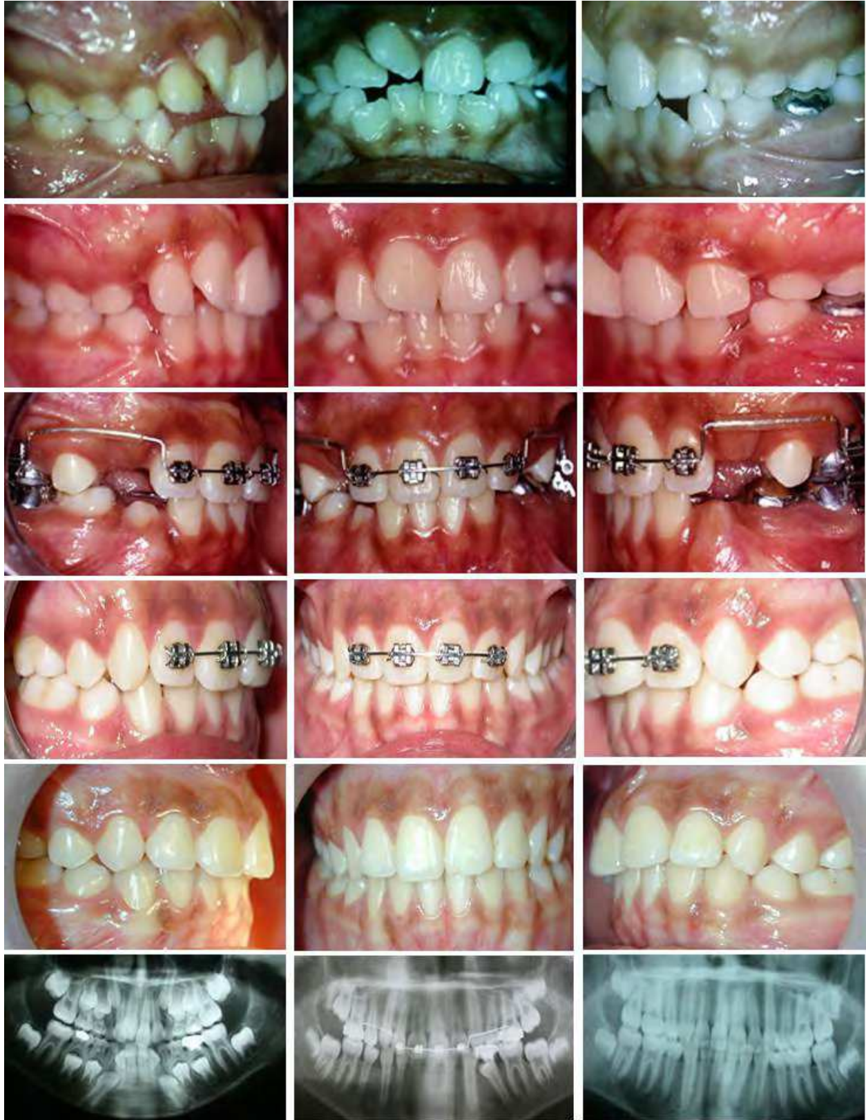
Case 7. Treatment of severe DMD in mixed dentition by serial extractions