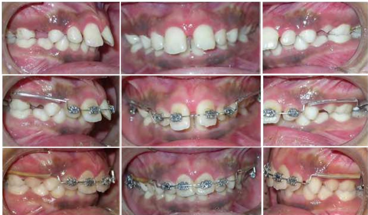
Case17. Ricketts basal arch as interceptive treatment of overbite