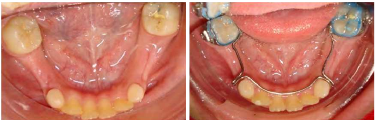
Case 2. Bilateral space maintainer