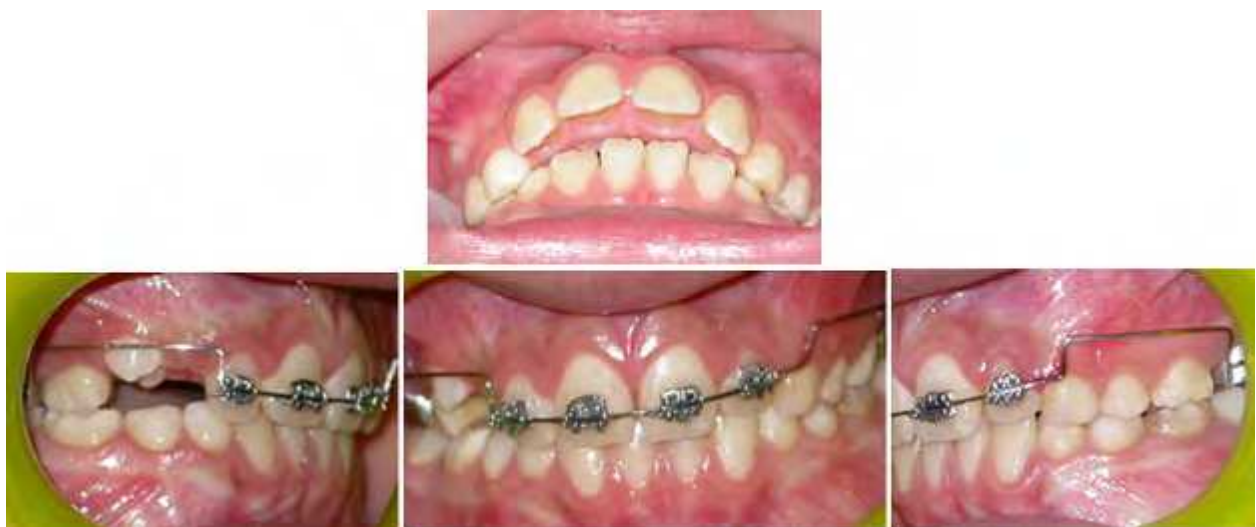
Case 16. Release of mandibular growth by raising over bite with a Ricketts basal arch

The benefits of early treatment of Class II abnormalities are numerous: e.g. the prevention of trauma to the maxillary incisors by overcorrection of overhang (KREIT 1968, O'MULLANE 1973), the interception of worsening malocclusion, and better psychological and social integration of the child. It has also been reported that the correction of Class II malocclusions improves orofacial functions (JANSON & HASUND 1981, WIGDOROWICZ-MAKOWEROWA 1979).