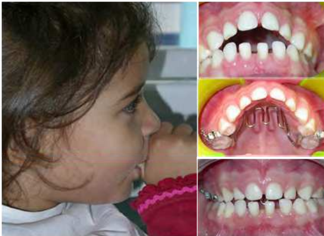
Case 15. Functional treatment of anterior open bite secondary to thumb sucking by a thumb guard