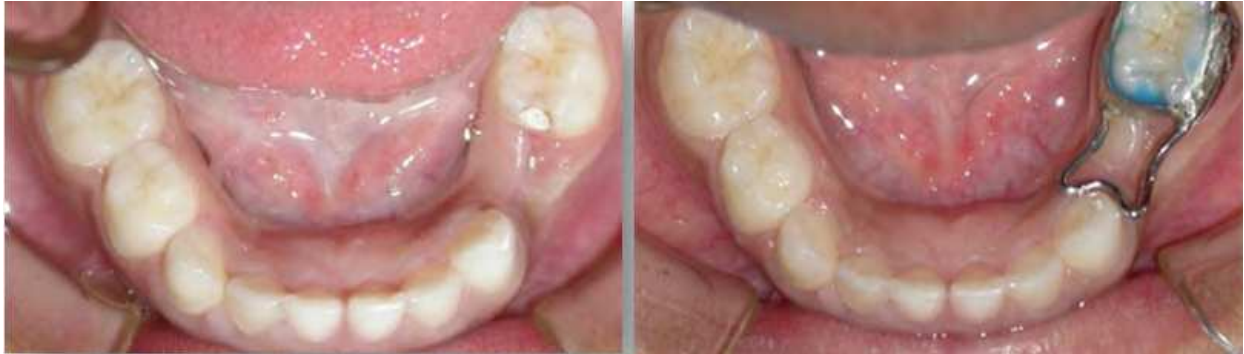
Case 1. Unilatéral space maintainer