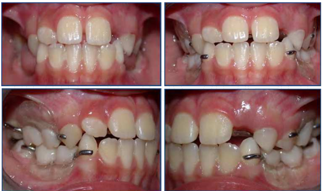
Case 3. Maintaining space by a removable paedodontic appliance