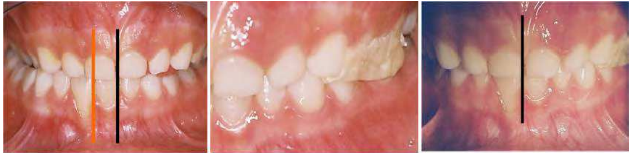
Case 9. Interceptive treatment of a right mandibular lateral deviation by resin direct tracks