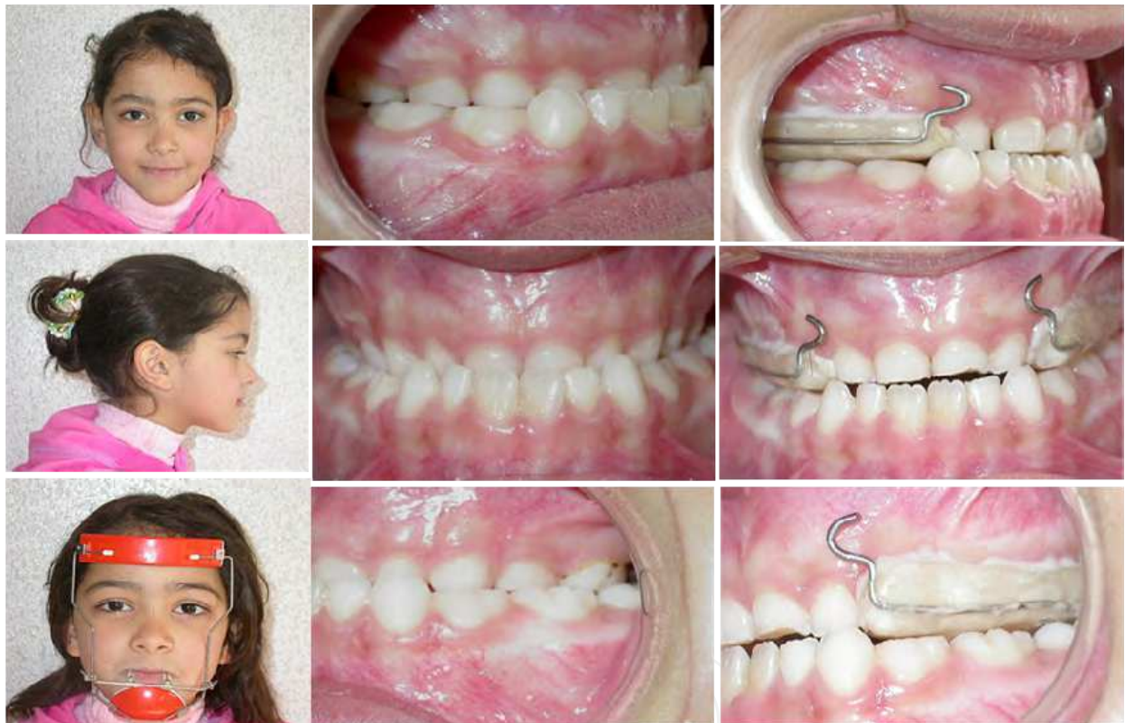
Case 23. Early treatment of skeletal Class III cases attributable to maxillary retrognathia with a DELAIRE's face mask