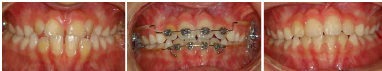
Case 22. Multiband treatment to vestibulate the upper incisors and to correct the incisor bite