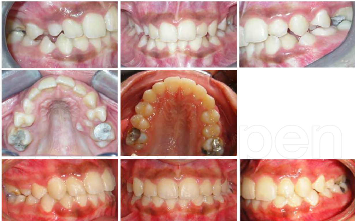
Case 6. Early treatment of lateral DMD by distalization of maxillary molars

If the DMD exceeds 7 mm, the interceptive approach of choice remains programmed extraction, also still called serial extractions or interceptive guidance of occlusion (J DALE) (Cases 7 and 8)