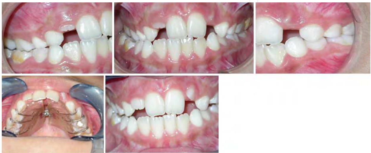
Case 10. Interceptive treatment of a mandibular lateral right deviation following a bilateral maxillary endoalveolitis by maxillary expansion using a median screw expander