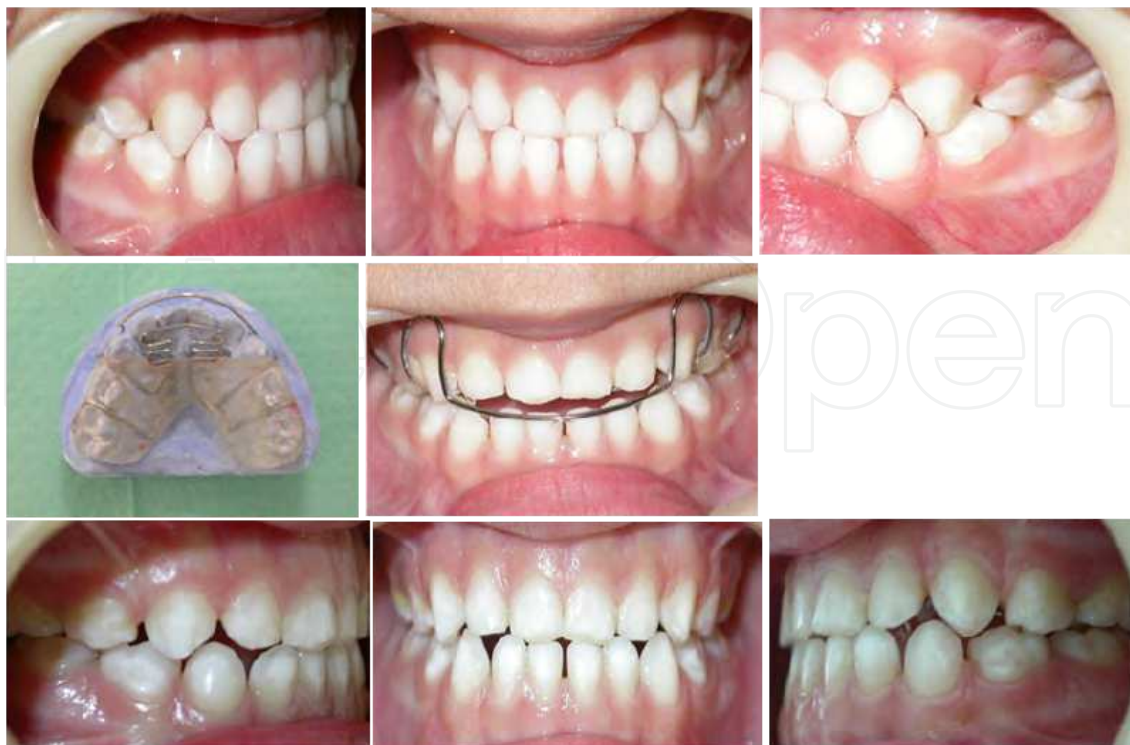
Case 21. Early correction of anterior crossbite with a removable Hawley plate fitted with a simple cantilever spring