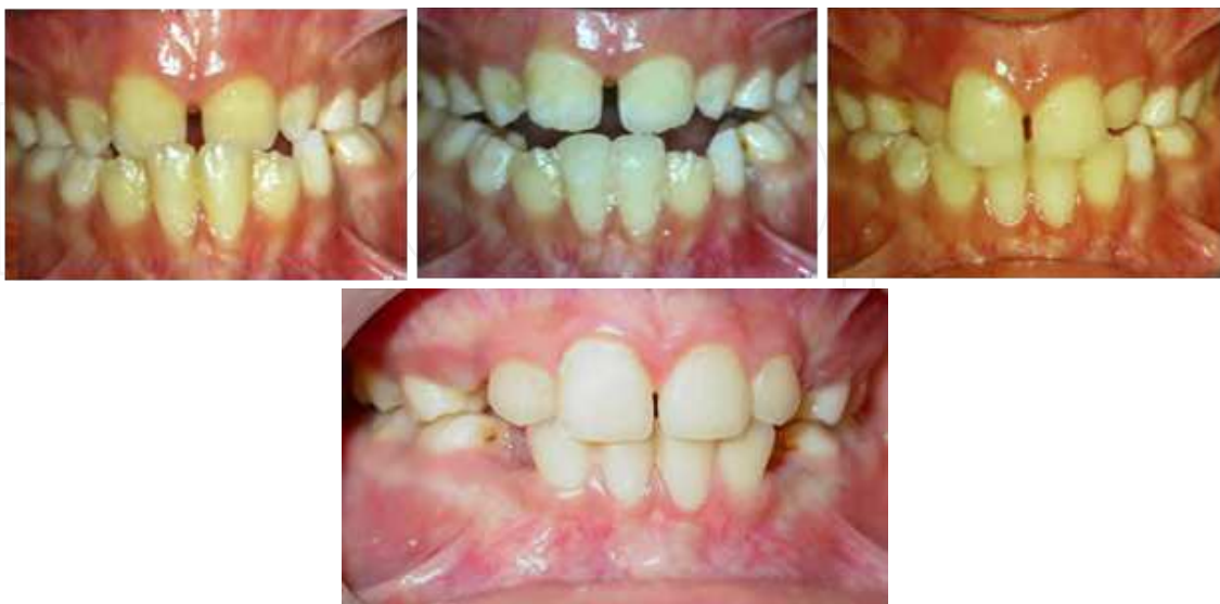
Case 20. Early correction of anterior crossbite with anterior composite inclined plane