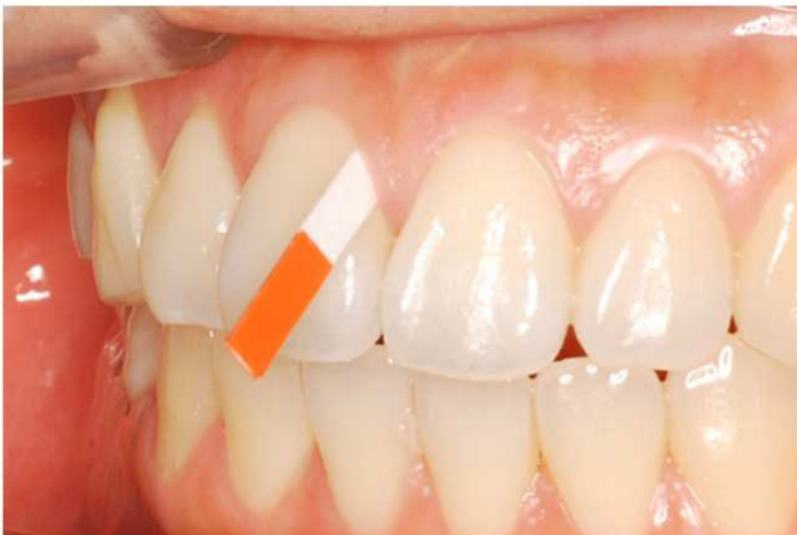
Fig. 1. GCF was collected from the mesial and distal sides of the upper central and lateral incisors.

GCF was collected from the mesial and distal sides of the upper central and lateral incisors. GCF sampling was performed using the method of Yamaguchi et al. (2006a), and collected at before (T1) and after (T2) orthodontic treatment. The tooth was gently washed with water, and then the sites under study were isolated with cotton rolls (to minimize saliva contamination) and gently dried with an air syringe. Paper strips (Periopaper, Harco, Tustin, CA, USA) were carefully inserted 1 mm into the gingival crevice and allowed to remain there for 1 minute, after which a second strip was placed at the same site. Care was taken to avoid mechanical injury. The contents were eluted out into 1x phosphate buffer saline (PBS) containing 0.1mM phenylmethylsulphonylfluoride and stored at -80°C until further processing (Fig. 1).